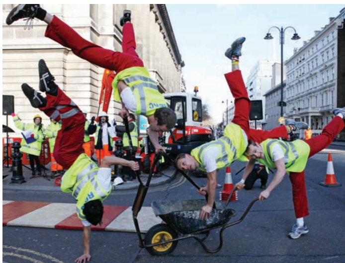
BOSi 'workmen' entertain the crowd

The crowd were treated to a surprise when performers disguised as workmen suddenly burst into song and dance. The routine, based on the Great Exhibition Polka of 1851, brought Exhibition Road to a standstill.