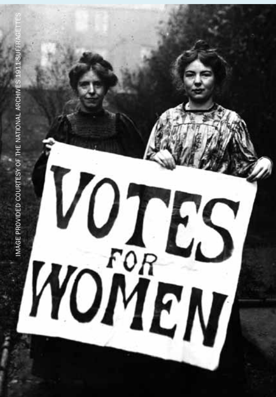
1911 SUFFRAGETTES

Spectrum Drama have been established for 25 years and are leaders in historic and contemporary site-specific theatre events. Recent work in RBKC includes performances at Leighton House and Linley Sambourne House and bringing Charles Dickens to libraries throughout the borough.