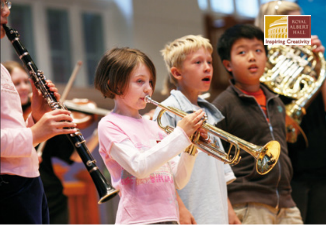
SUNDAY JULY 21, 10.00AM - 3.15PM