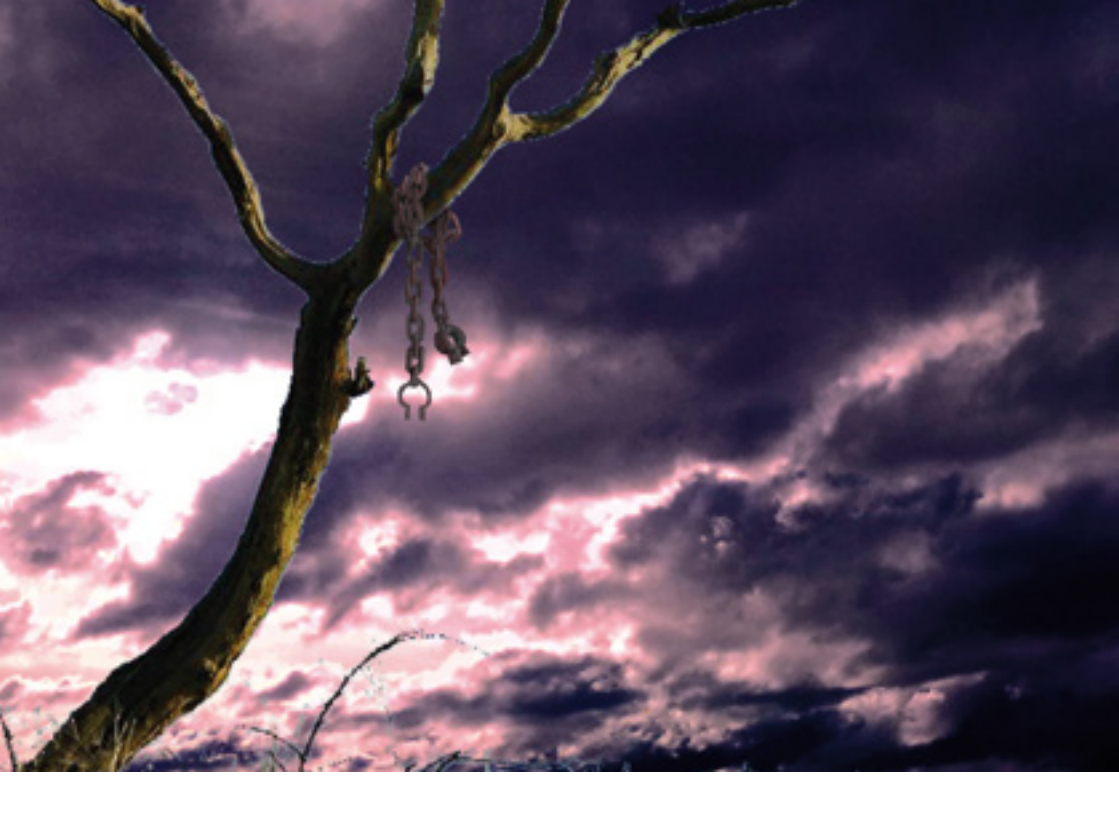
THURSDAY 25 - SATURDAY 27 JULY, 8.00PM