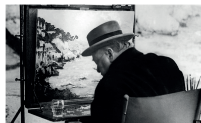
Churchill painting on holiday in 1949, © Churchill Heritage Ltd. Reproduced with permission from the Churchill Heritage Ltd.