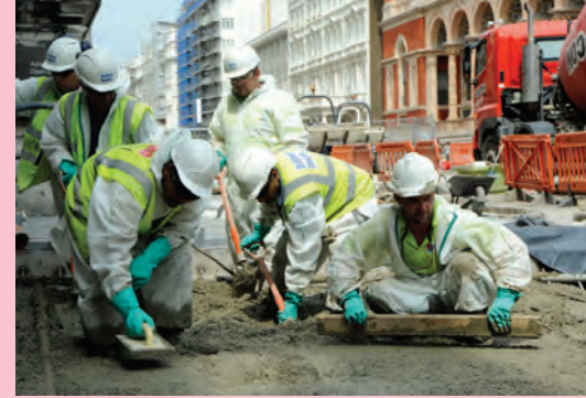
Ground workers laying the road base