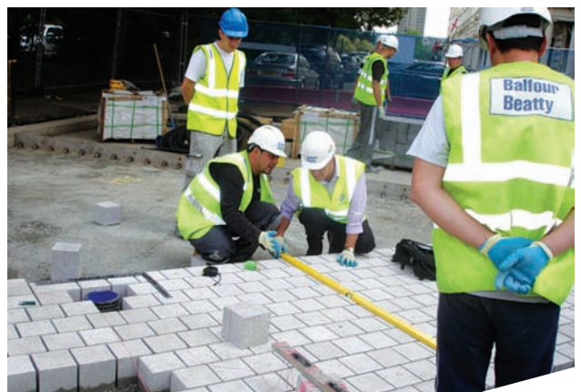
Precision granite laying

exhibitionroad@rbkc.gov.uk Shirley Long – 020 7361 3238 www.rbkc.gov.uk/exhibitionroad