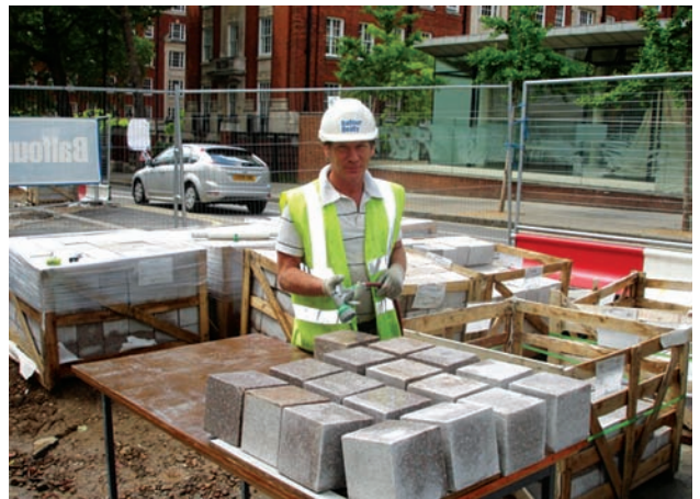
Wetting and inspecting the granite