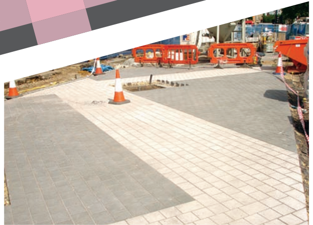
New granite at southern end of Exhibition Road

When finished, the stone setts, laid in a geometric pattern, will create an elegant and durable kerb-free surface that will last for generations – and never need resurfacing.