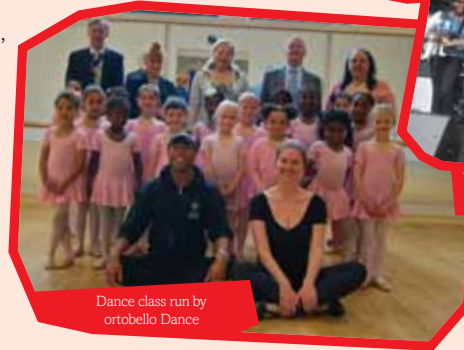
Dance class run by Portobello Dance

And that's just the highlights! You can contact your councillors, find out more about these projects and others, see how to get involved and submit your own project idea at www.citylivinglocallife.org