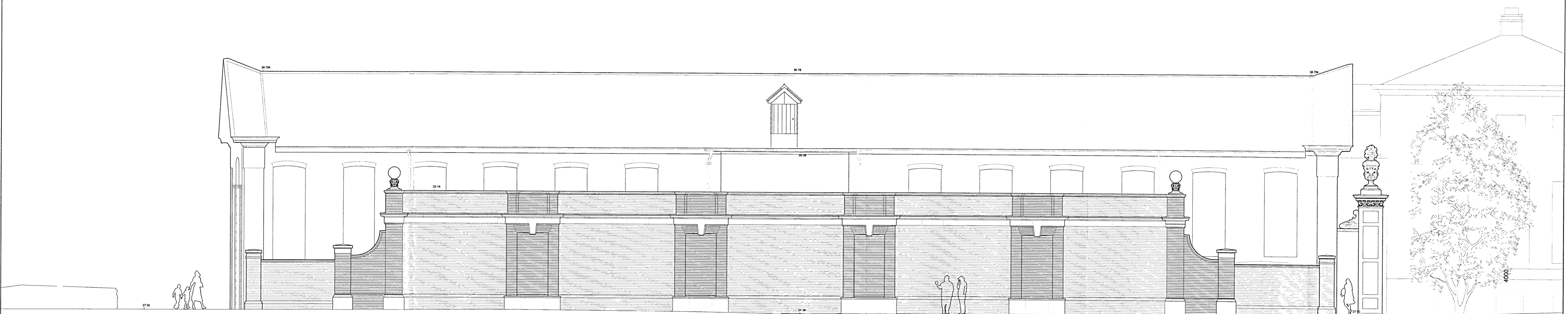
PROPOSED BUILDING ELEVATION_1-100 (@A1)