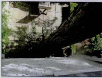
EXISTING TREE TO ADJACENT PROPERTY

EXISTING FALSE ACACIA TO ADJACENT PROPERTY