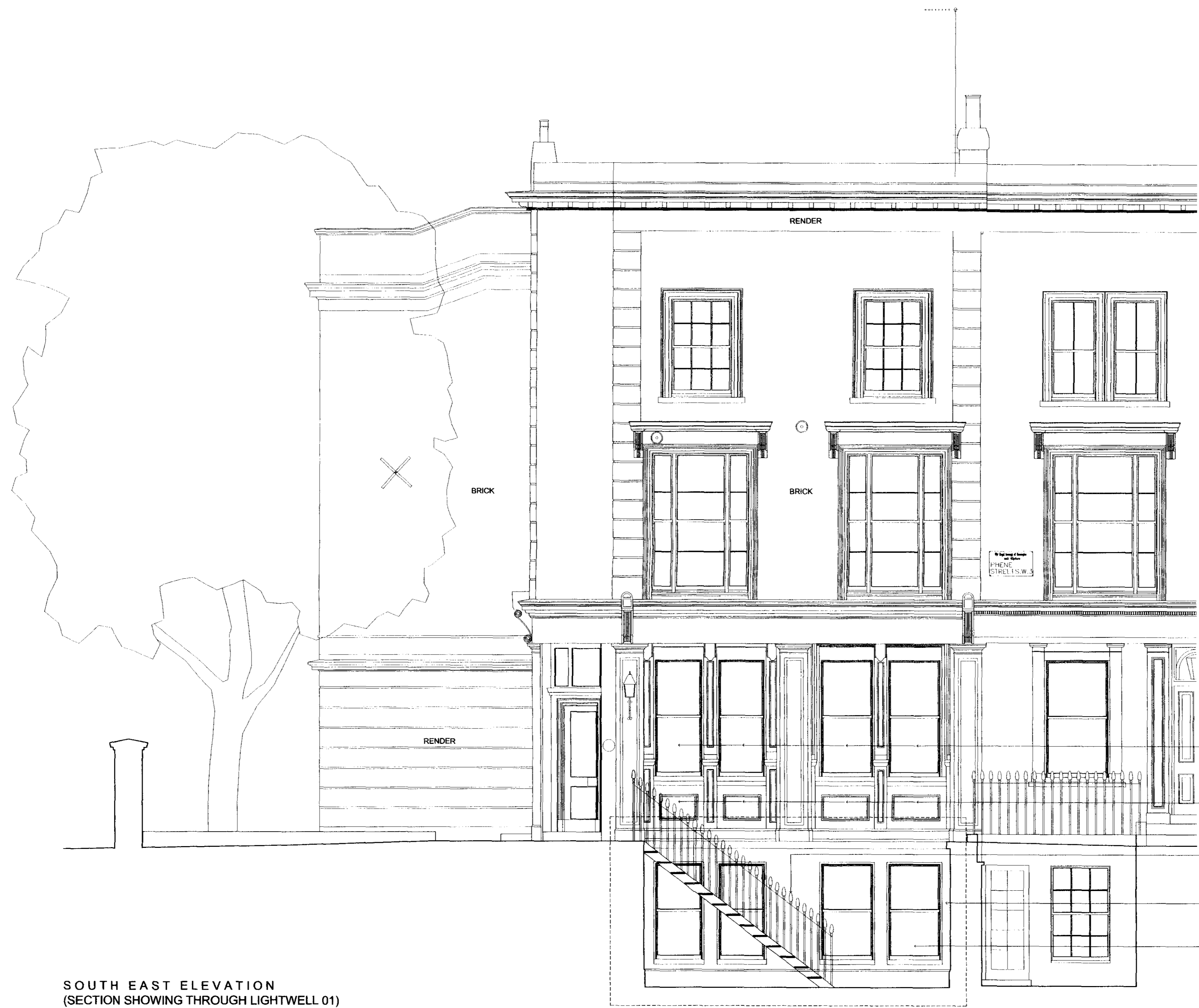
SOUTH EAST ELEVATION (SECTION SHOWING THROUGH LIGHTWELL 01)