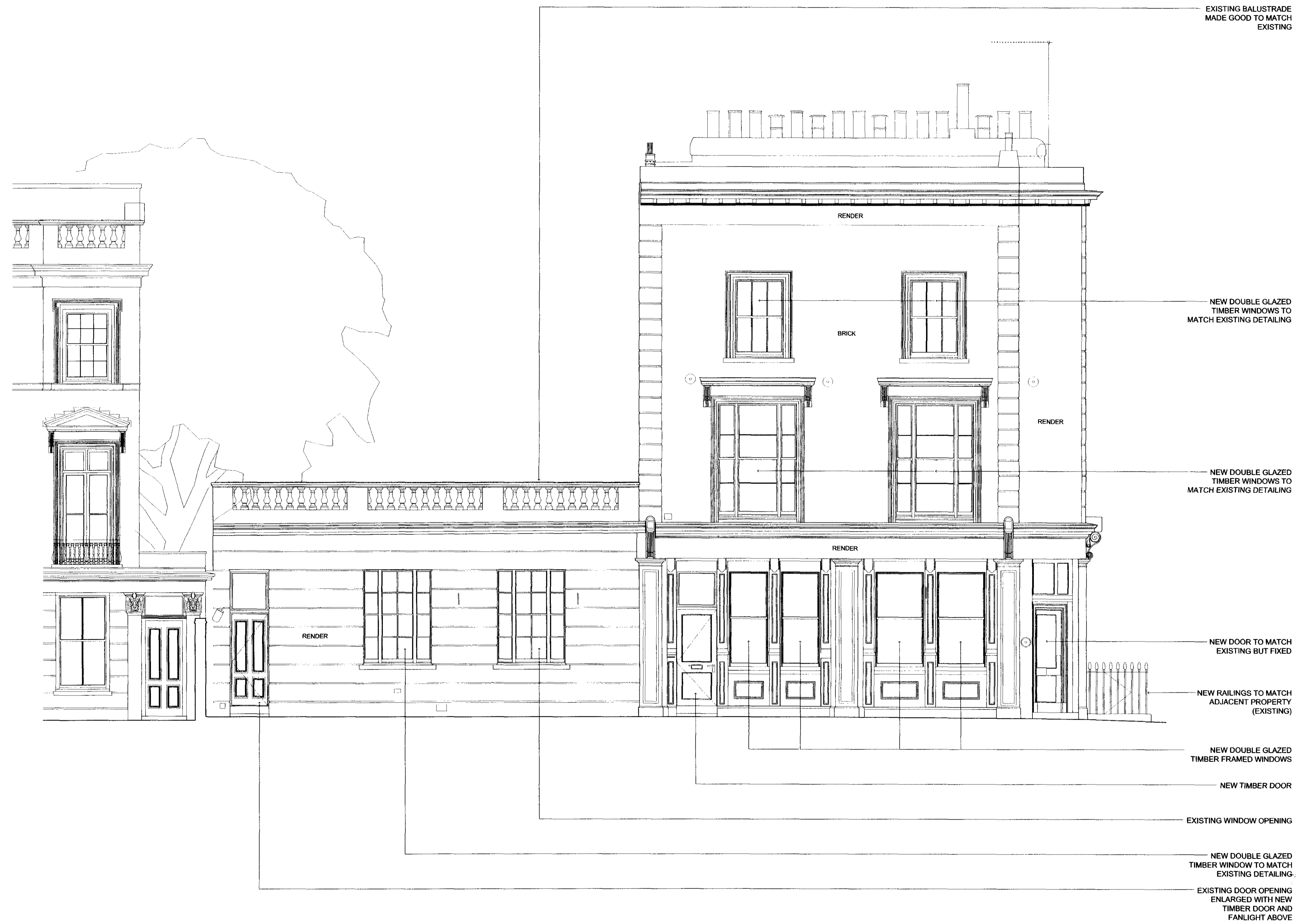
SOUTH WEST ELEVATION - 1:50 @ A1