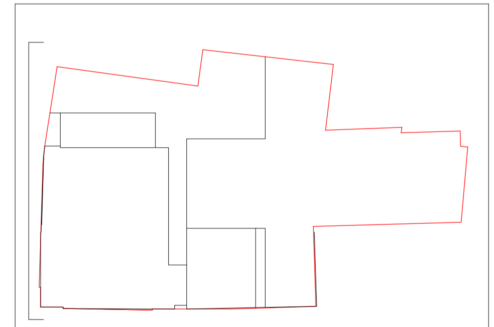
KEY PLAN - NOT TO SCALE