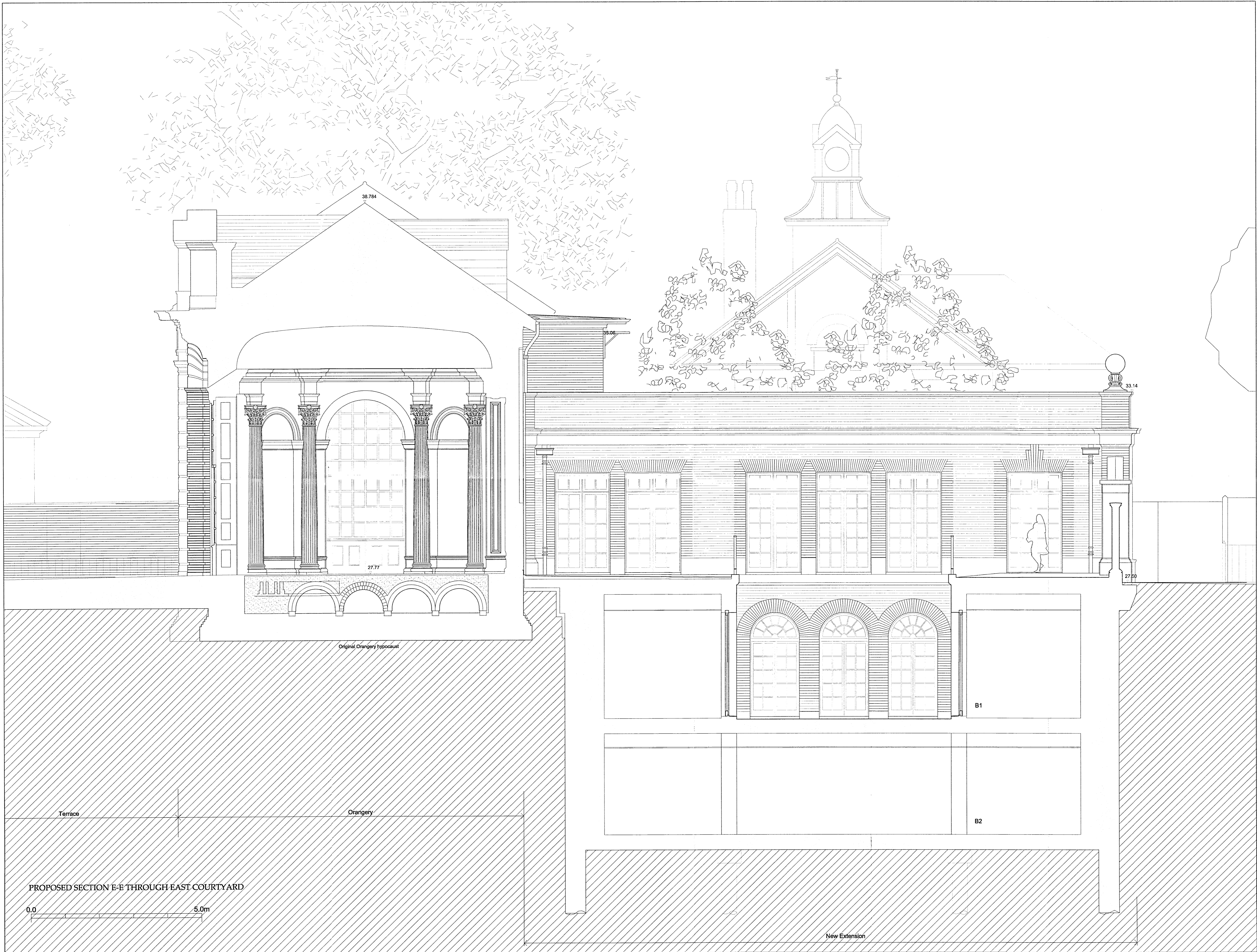
PROPOSED SECTION E-E THROUGH EAST COURTYARD