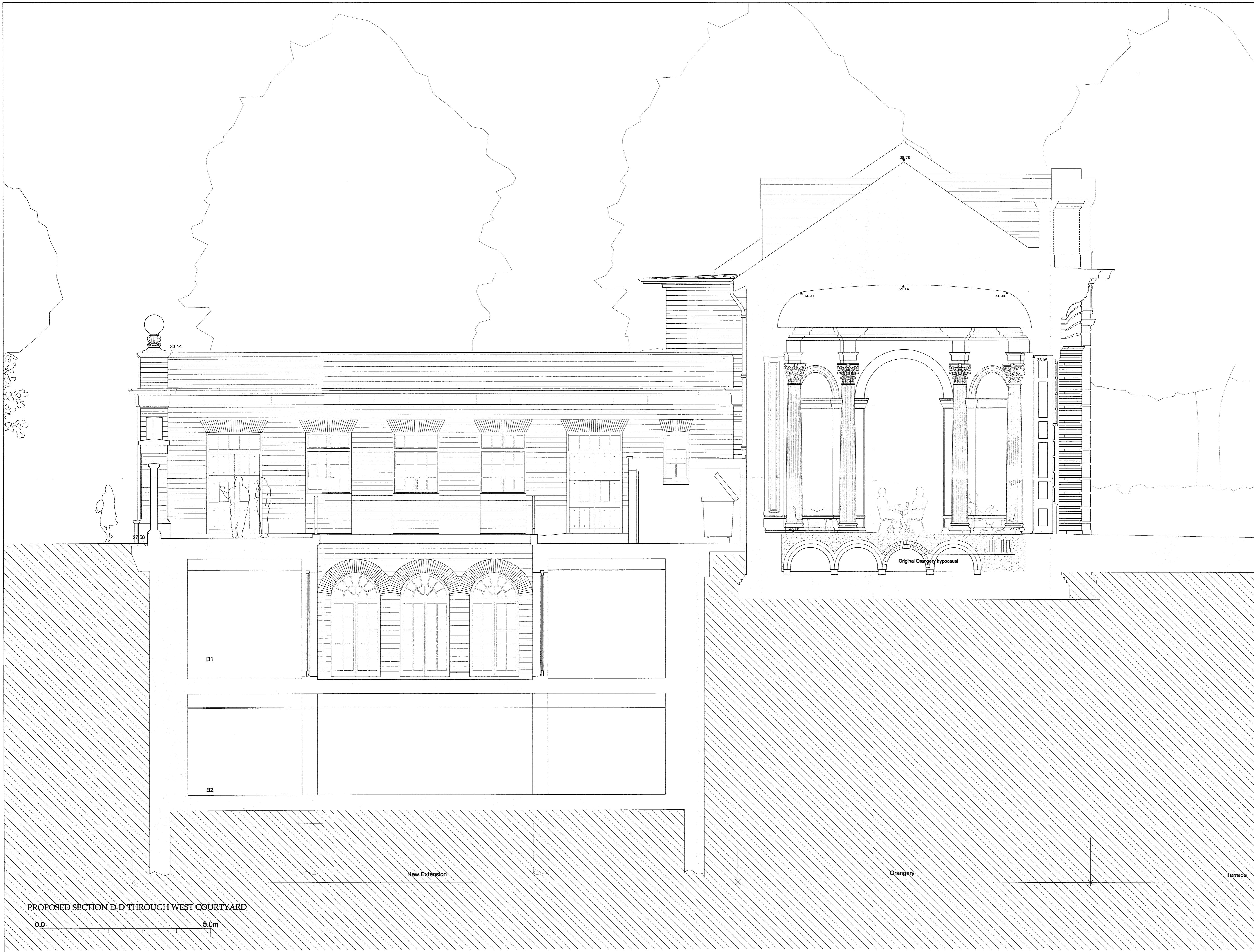
PROPOSED SECTION D-D THROUGH WEST COURTYARD