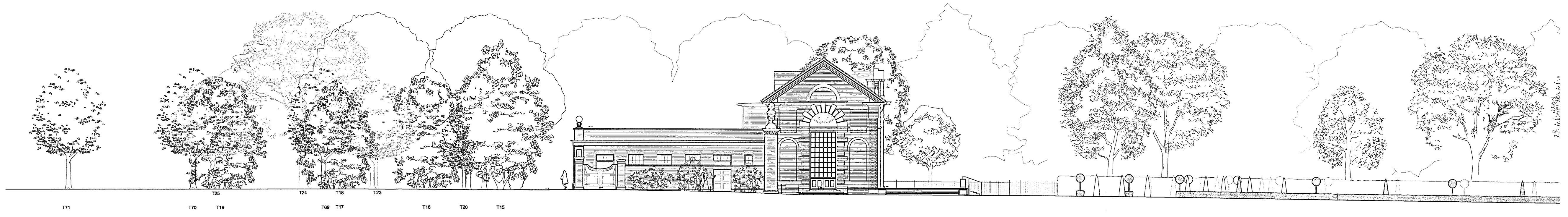
PROPOSED ELEVATION OF SITE FROM WEST