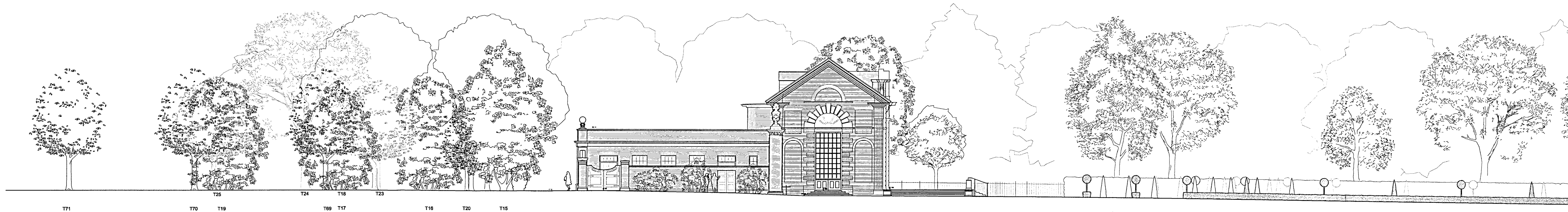
PROPOSED ELEVATION OF SITE FROM WEST