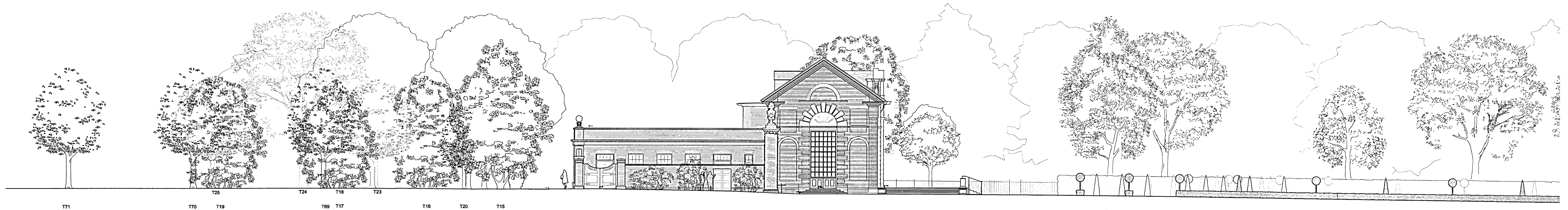
PROPOSED ELEVATION OF SITE FROM WEST