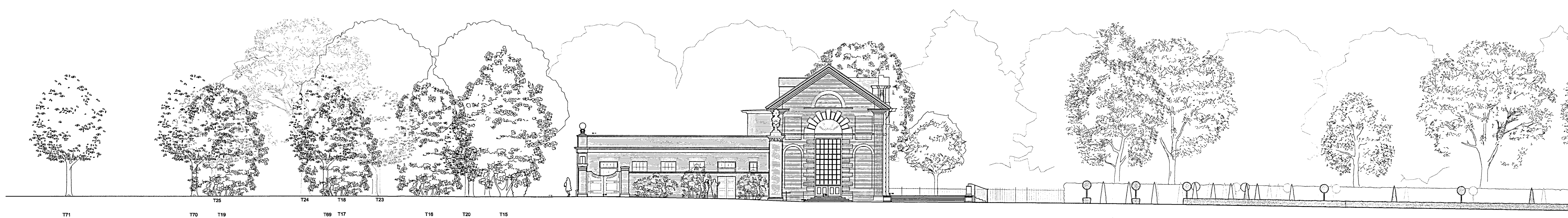
PROPOSED ELEVATION OF SITE FROM WEST