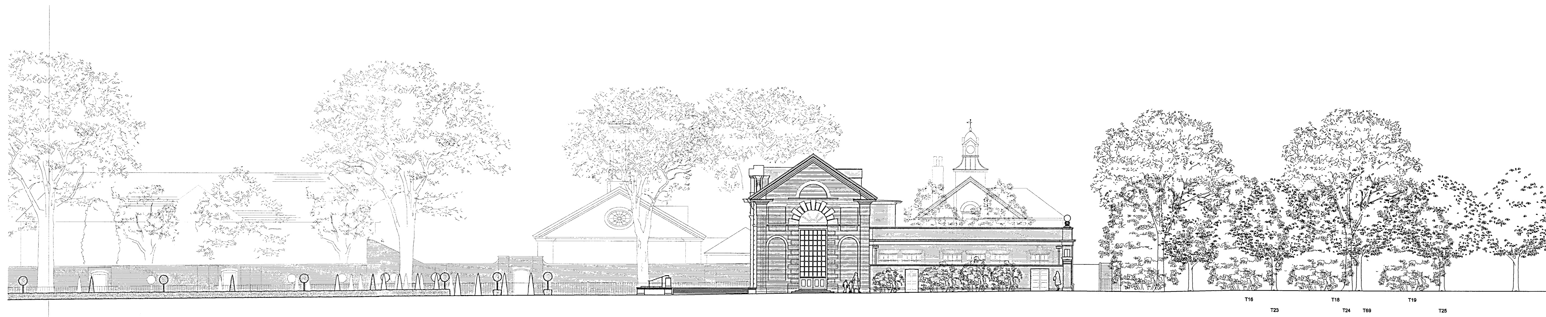
PROPOSED ELEVATION OF SITE FROM EAST