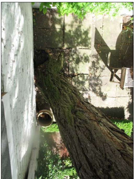
EXISTING TREE TO ADJACENT PROPERTY

EXISTING FALSE FACIA TO ADJACENT PROPERTY