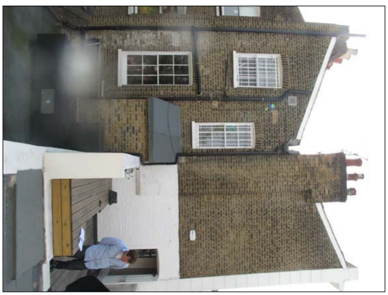
VIEW TO PHENE ARMS