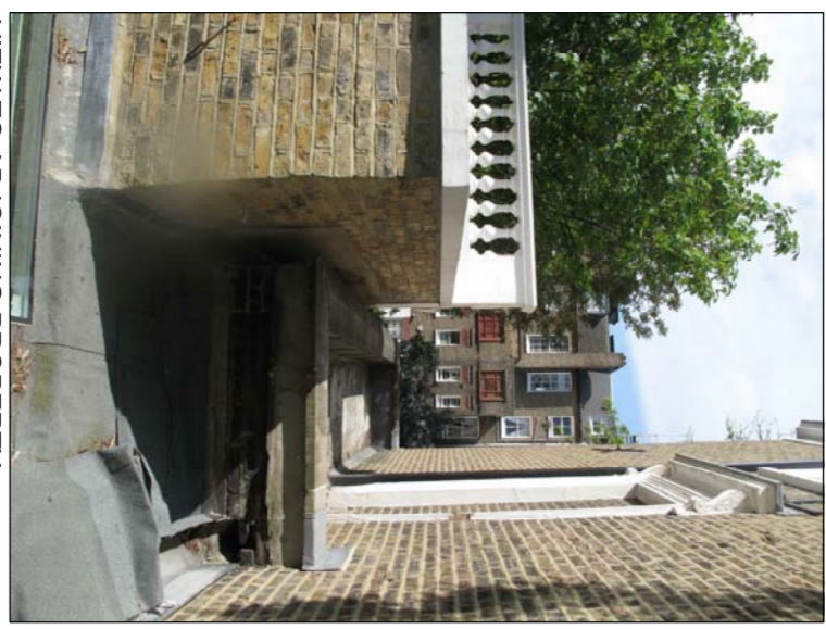
VIEW TO ADJOINING PROPERTY