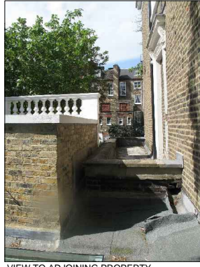
VIEW TO ADJOINING PROPERTY