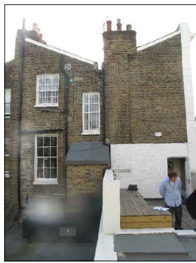
VIEW TO PHENE ARMS