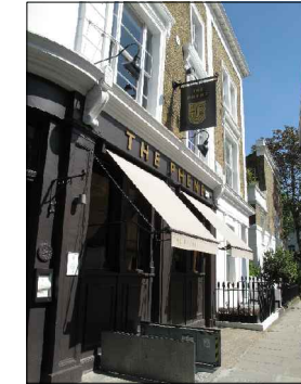
EXISTING COVERED LIGHTWELL

EXISTING FALSE ACACIA TO ADJACENT PROPERTY