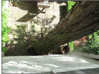
EXISTING TREE TO ADJACENT PROPERTY

EXISTING FALSE ACACIA TO ADJACENT PROPERTY