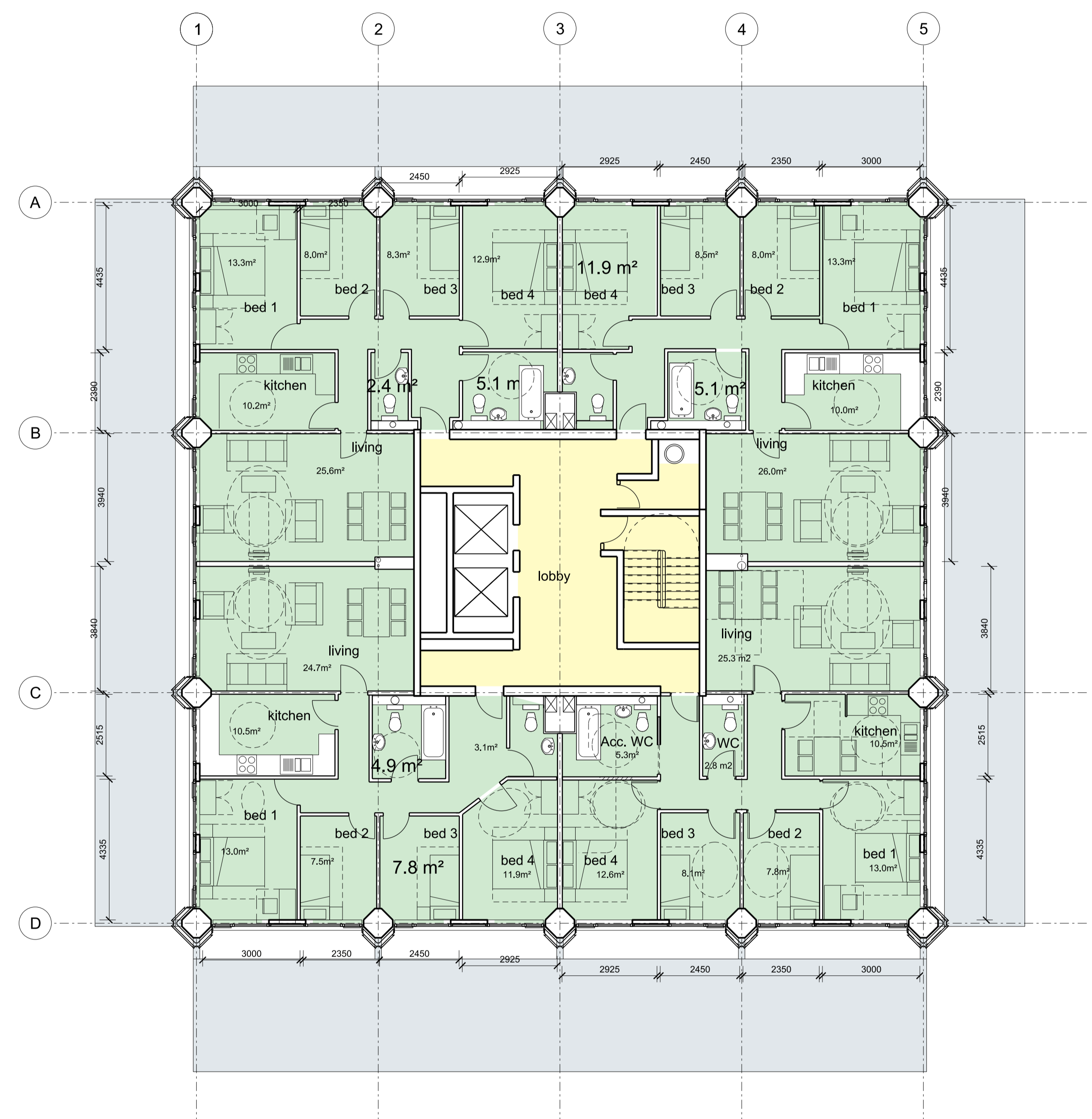
PROPOSED FLOOR PLAN