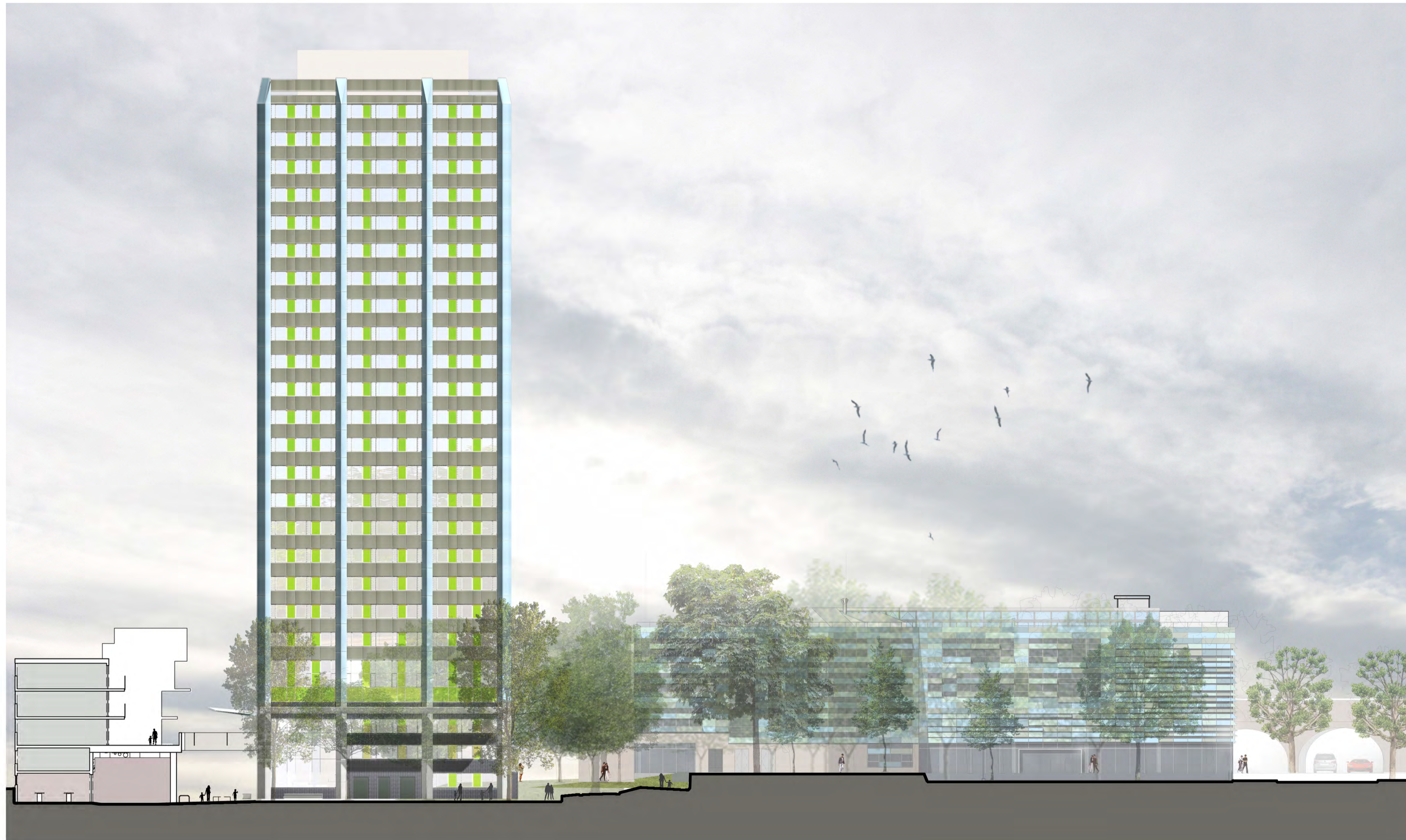
2 EAST ELEVATION 1:200