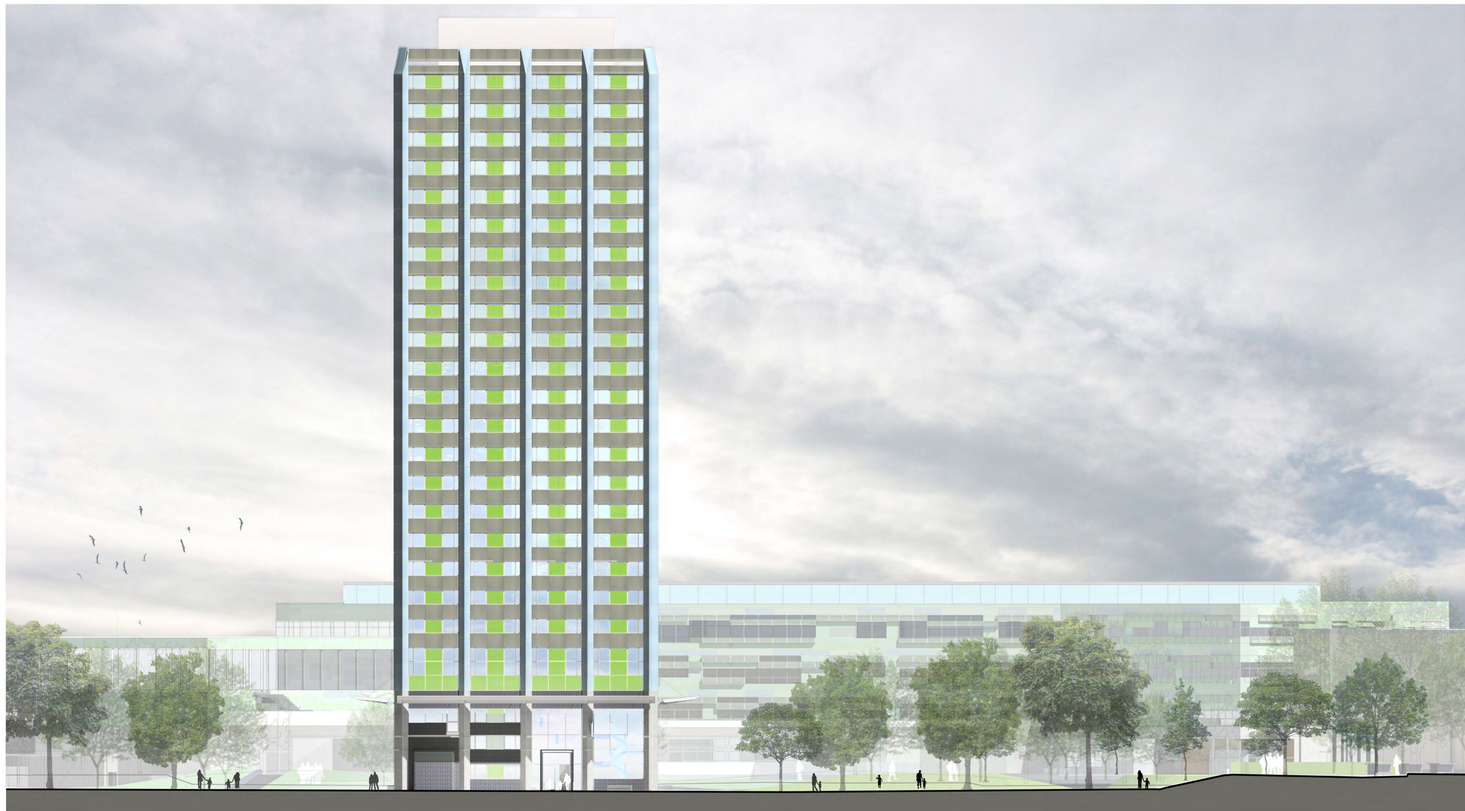
3 SOUTH ELEVATION 1:200