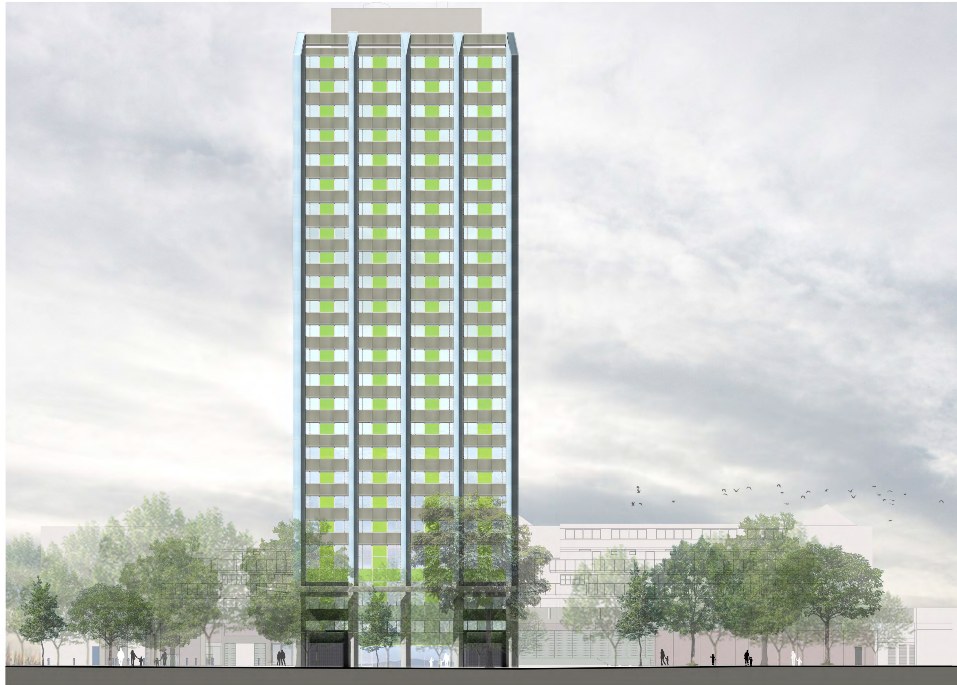
4 NORTH ELEVATION 1:200