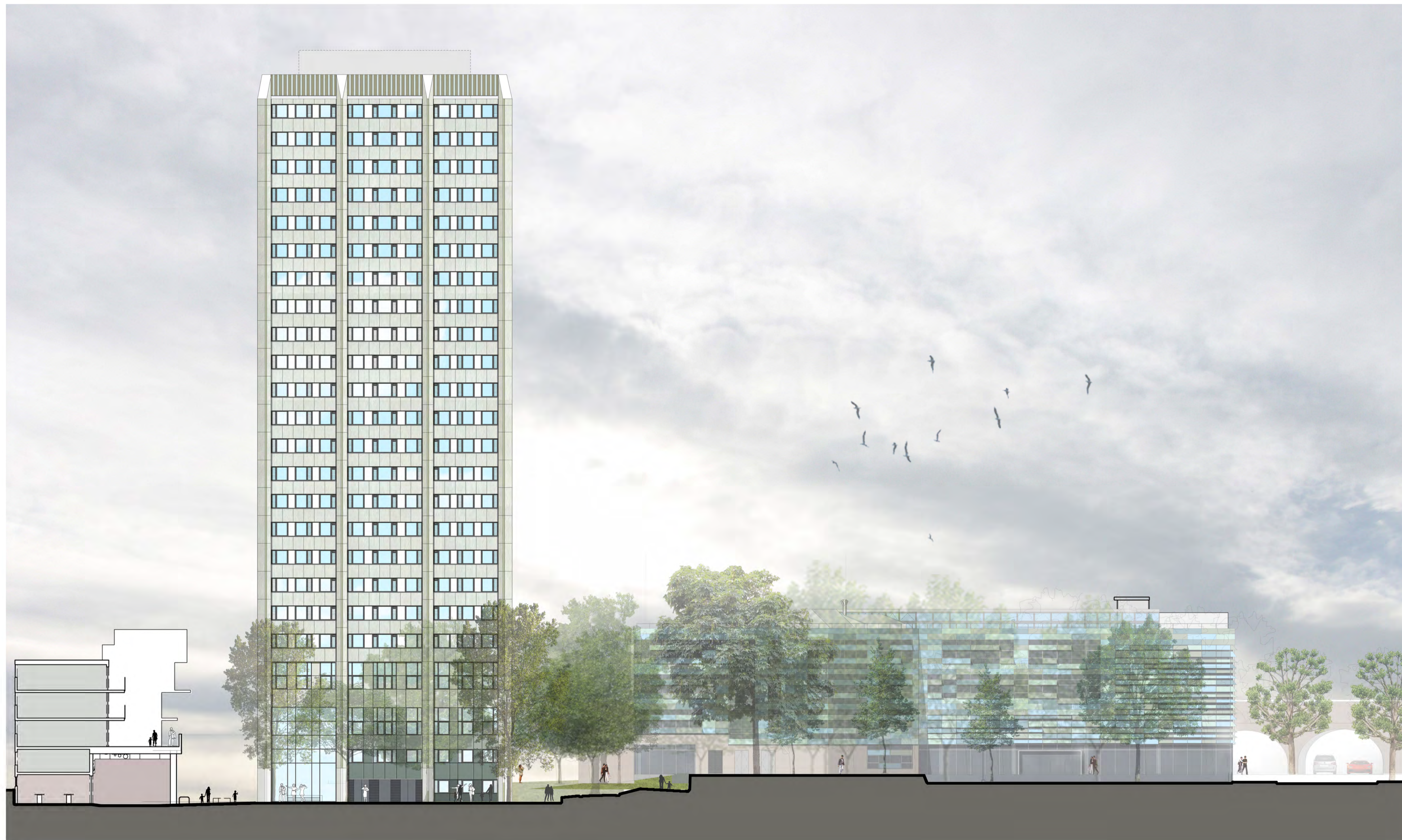
2 EAST ELEVATION 1:200