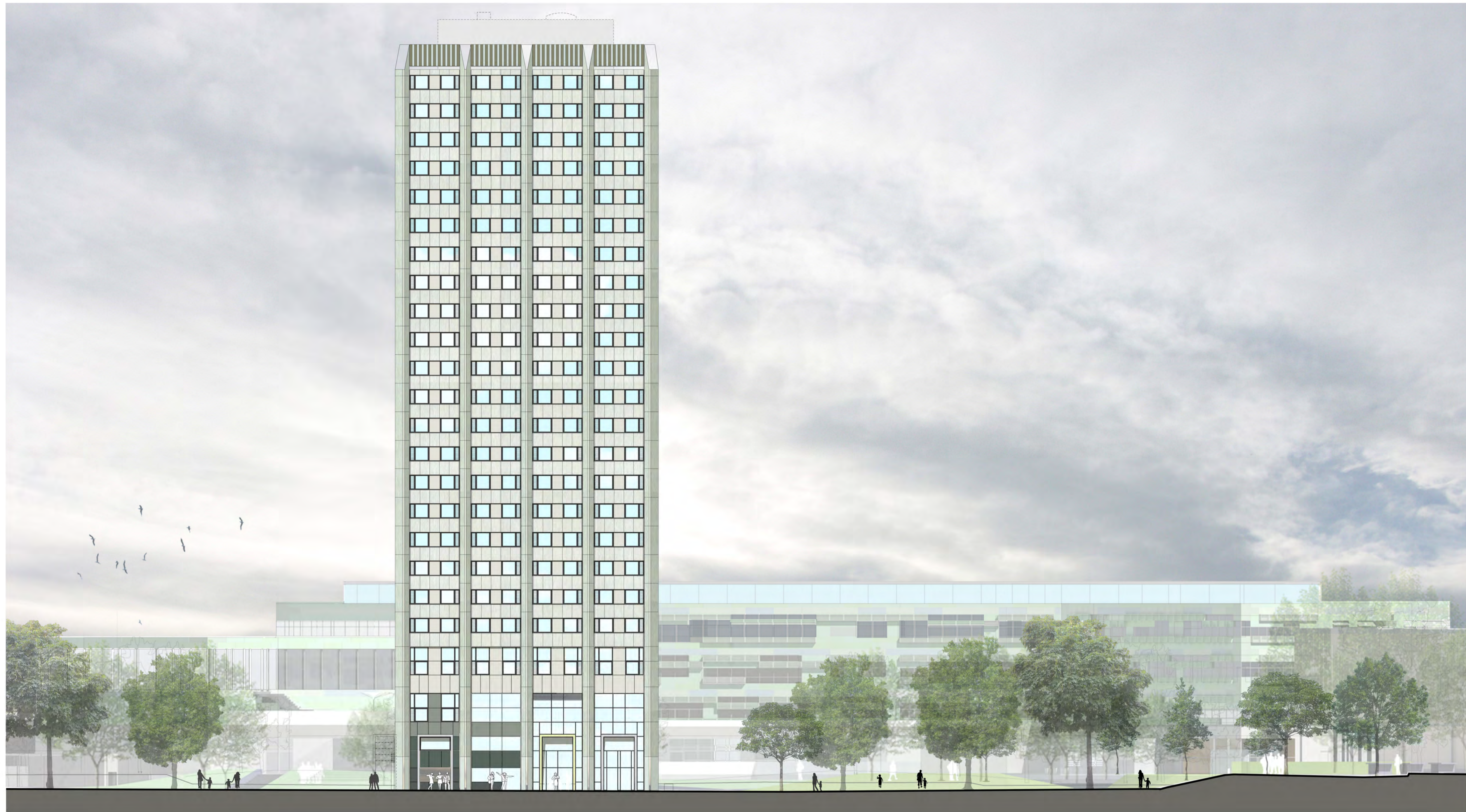
3 SOUTH ELEVATION 1:200