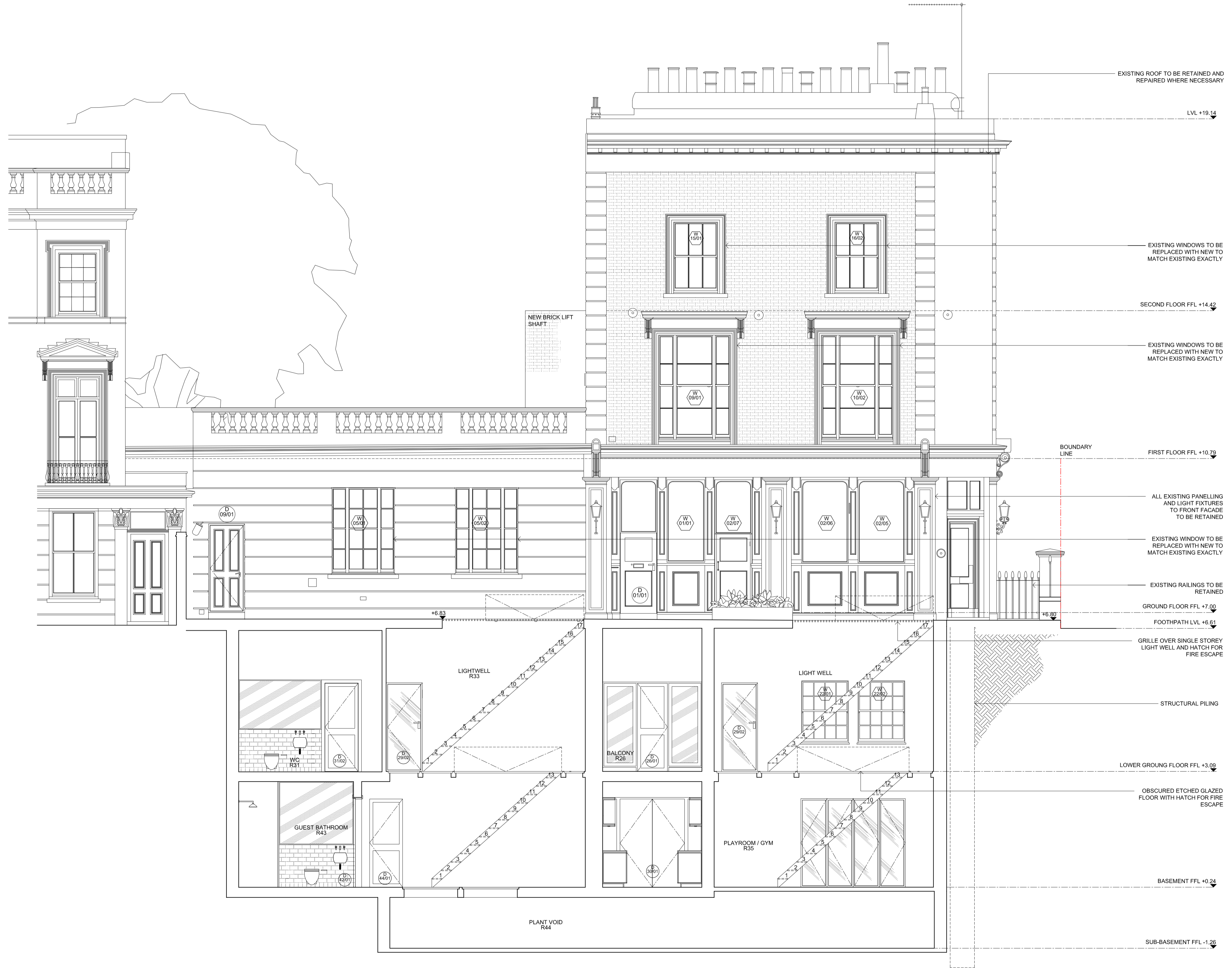
PROPOSED SECTION DD - SCALE 1:50 @ A1 & 1:100 @ A3