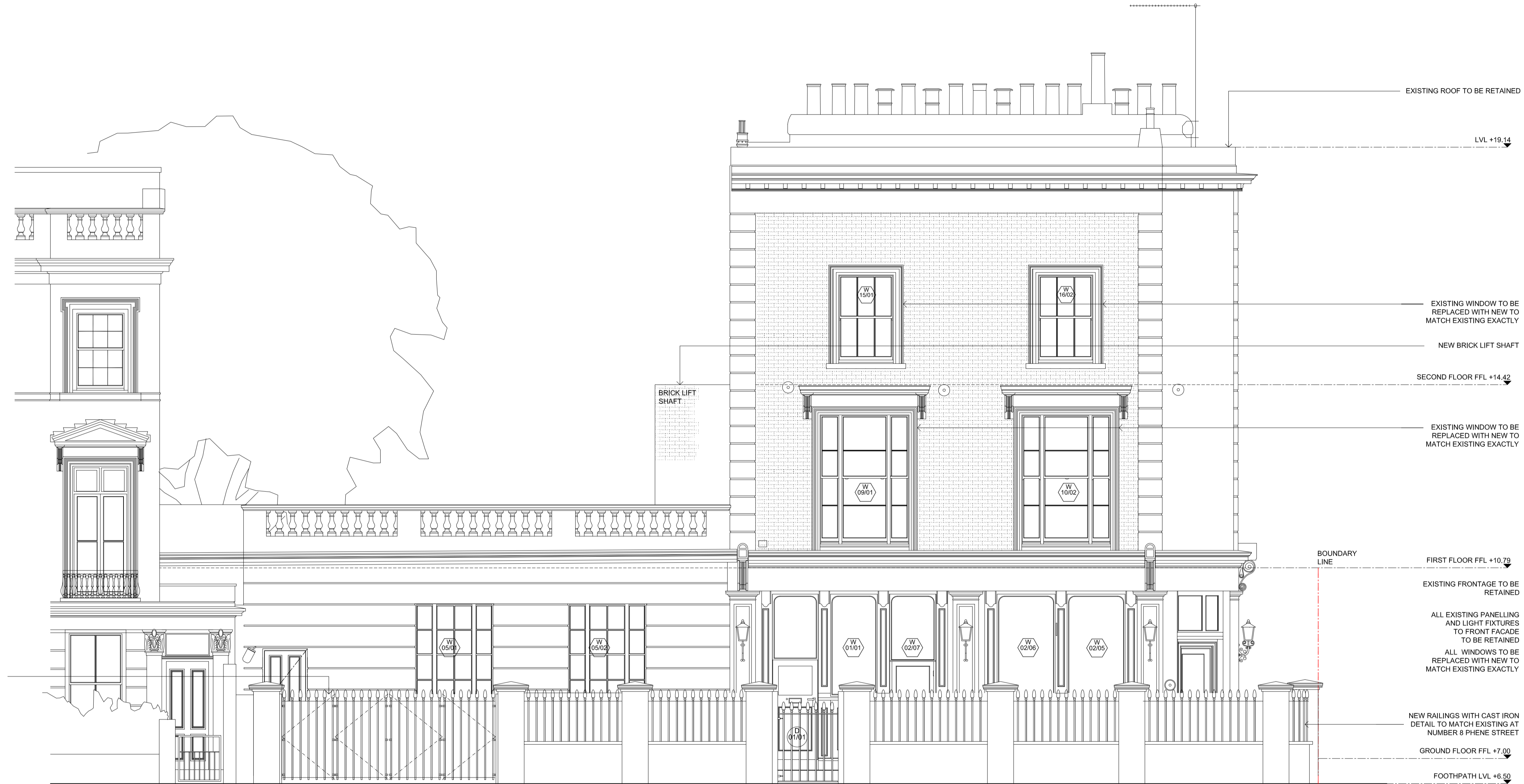
PROPOSED SOUTH WEST ELEVATION - SCALE 1:50 @ A1 & 1:100 @ A3