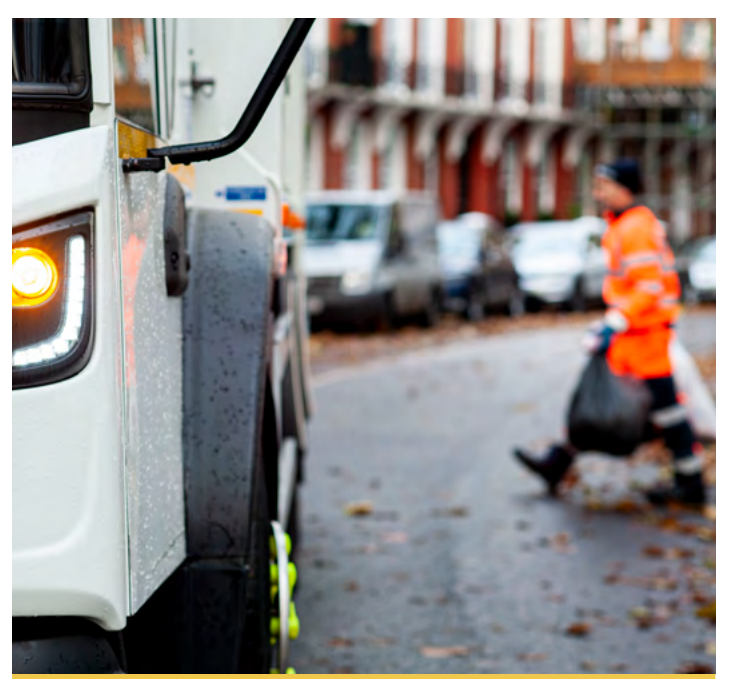
For more information about recycling, and services available to reduce and reuse your waste, visit www.rbkc.gov.uk and search 'bins and recycling'

For more information and to book a collection visit www.rbkc.gov.uk/traid