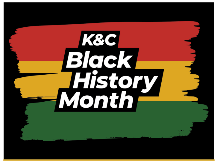
Visit www.rbkc.gov.uk and search 'Black History Month Grants'.

Applications close on Monday 9 August so make sure you don't miss out and email culture@rbkc.gov.uk for more details.