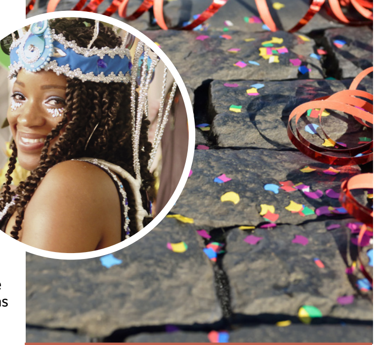
More details will be released closer to the time but information on how to enjoy Carnival this year is available at www.nhcarnival.org

The organisers, Kensington and Chelsea and Westminster City Councils and the Police are working together to ensure we all stay safe, and do not support any unlicensed events or street parties taking place in the borough over the weekend.