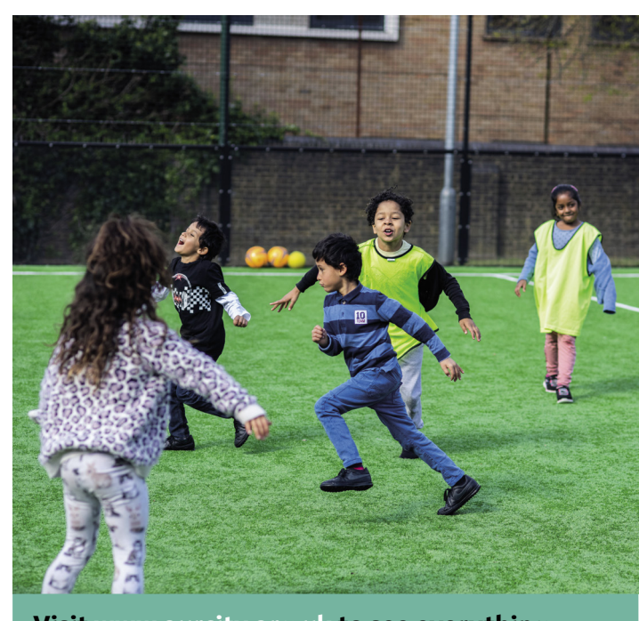
Visit www.ourcity.org.uk to see everything that's on offer and start planning your summer.

A guiding principle of the HAF is to ensure that young people stay occupied and entertained during the summer break and that those who need to receive a free lunch do so. Places will be prioritised for this group but there's plenty of room for all young people to get involved and activities to meet the needs of those with special educational needs and disabilities too.