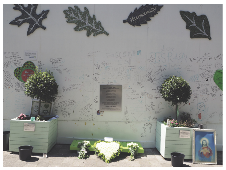
The Grenfell Tower Memorial Commission plaque and olive trees at the Grenfell Tower site.

In their commemorative video, the Memorial Commission's community representatives emphasise their wish to hear the hopes and ideas of as many bereaved families, survivors and residents as possible. This will make sure that the future memorial is developed by the community, for the community.