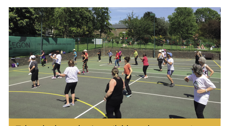
Take a look at what's available and start getting active. Visit www.rbkc.gov.uk and search 'Activities for Adults'.

The fitness sessions kick off on Monday 28 June and take place throughout July at parks in North Kensington and beyond. They are open to people of all ages, abilities and backgrounds and feature tai chi, yoga and circuit classes.