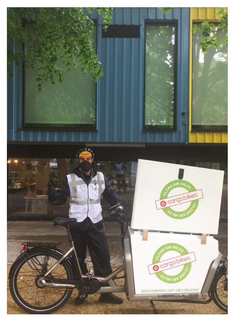
To find out more about e-cargobikes, visit www.e-cargobikes.com or http://www.e-cargobikes.com

Now five more pharmacies in the area have said they would like to use the bikes to deliver prescriptions to residents' homes, helping those in vulnerable groups. The bikes will be on offer for free for 31 hours per week.