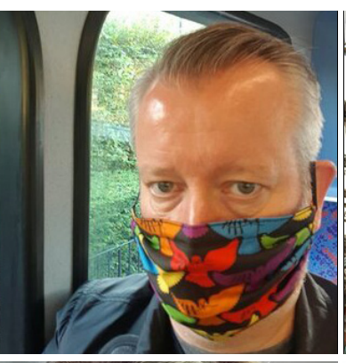
page 11 Free coaching for local people