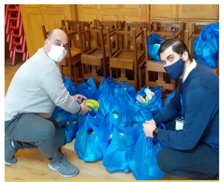
For more information, visit www.voluntarywork.org.uk

VCKC has drop-in sessions where its trained advisors are on hand to match you with local and relevant opportunities and answer any questions you may have. VCKC will explore the reasons you want to volunteer and contact local organisations on your behalf. Visit www.voluntarywork.org.uk to see the latest volunteering opportunities or email registration@vckc.org.uk to make an appointment to see an advisor.