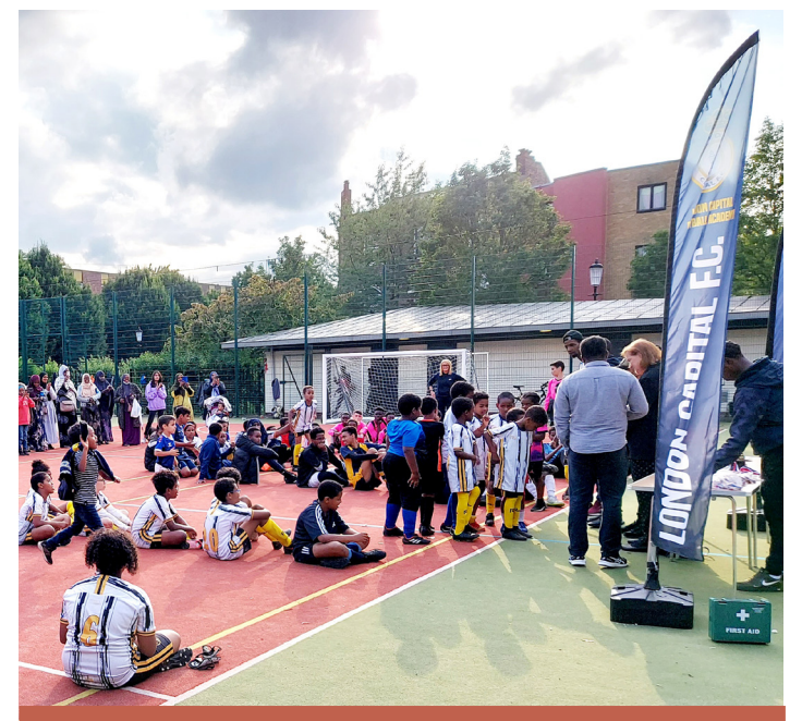
To find out more about London Capital FC and the Learning Club, visit @LondonCapitalFC and @LearningClubCA on Twitter.

This summer saw children across North Kensington take part in an exciting football tournament organised by London Capital FC on Saturday 21 August.