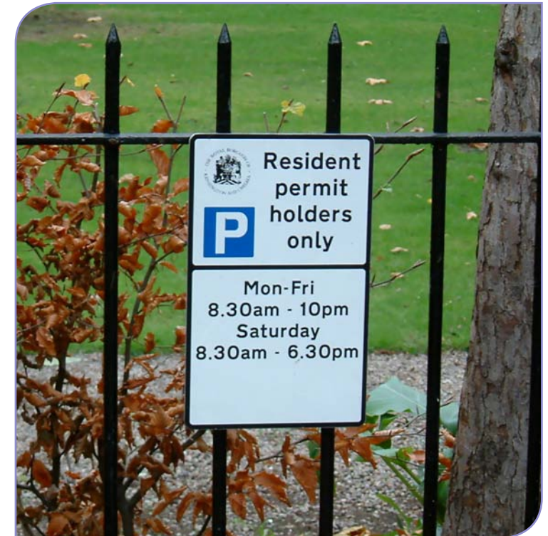
Railings are fine for parking signs

Controlled parking zone entry and exit signs are required at the zone boundary. In addition, each parking place must be individually signed. Careful design layouts and thoughtful designation of bays can take advantage of existing posts and lamp columns to reduce the need for new posts. Where property owners are in agreement it is often possible to attach signs to walls and railings.