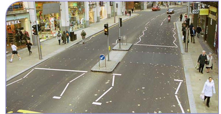
There is no need for longer zigzag markings – Kensington High Street

For all new pedestrian crossings the standard length for zigzag markings will be two marks except where there is insufficient visibility on the approach to the crossing. Zigzags should not extend into side roads.