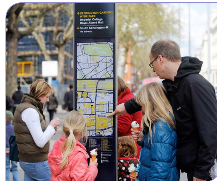
Consulting a minilith at South Kensington

Where we adopt Legible London signage in the Borough we will remove any existing unnecessary directional, signs creating a less cluttered environment.