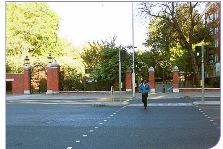
Minimum markings at crossing near Holland Park