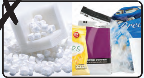
No mixed plastics/polystyrene or cling film