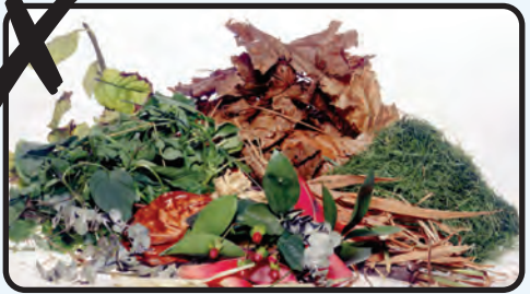
No garden waste