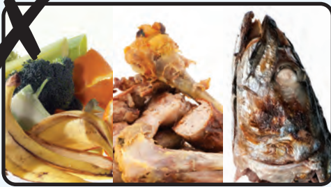
No food waste

Do not put any of these items in your recycling bag: