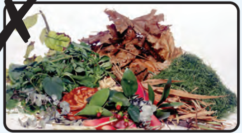
No garden waste