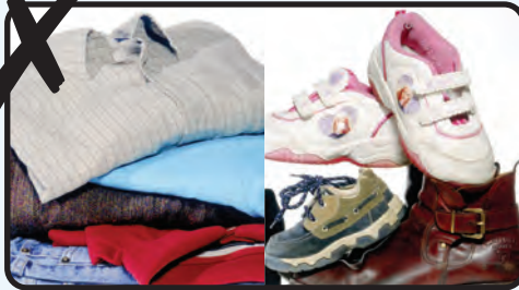
No clothes, shoes or textiles