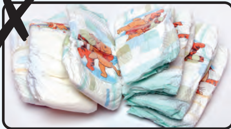
No nappies (including used nappies)