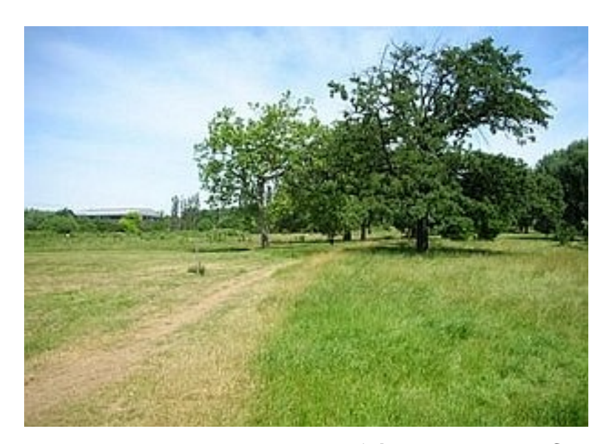
'Little Wormwood Scrubs'

The knowledge of knowing that there once was an open river that ran through the Notting Barns West will aid in the creation of a new area name. This is relevant to the naming proposal as it will provide further background evidence of Notting Barns West area and provide an environmental link to the area.