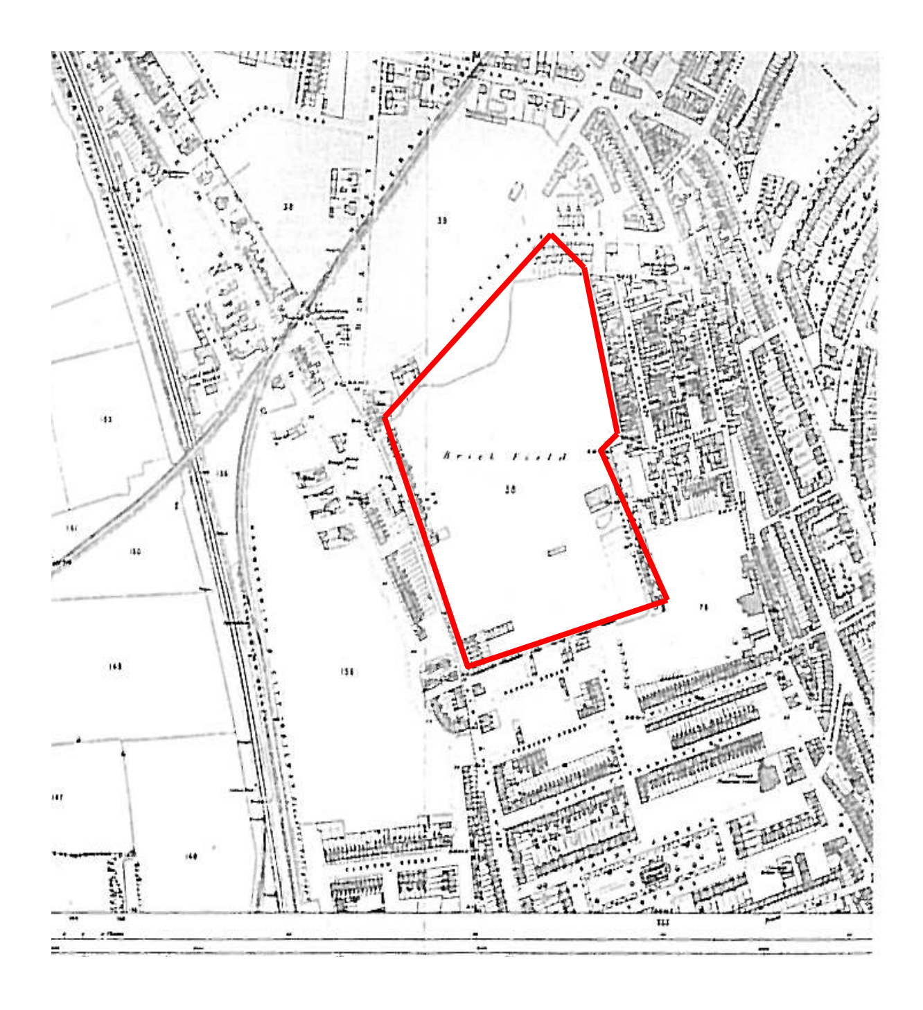
1871- The Brickfield site used extensively for industry and agriculture. The surrounding area housed many of the potters, brick makers, and their pigs to the rear of their dwellings. Large open spaces visible to the surrounding area of brickfields, was used by the neighbouring farms