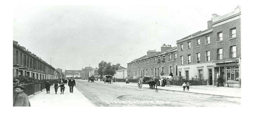
'Latimer Road (Northern end, looking towards North Pole Road) circa 1900.'