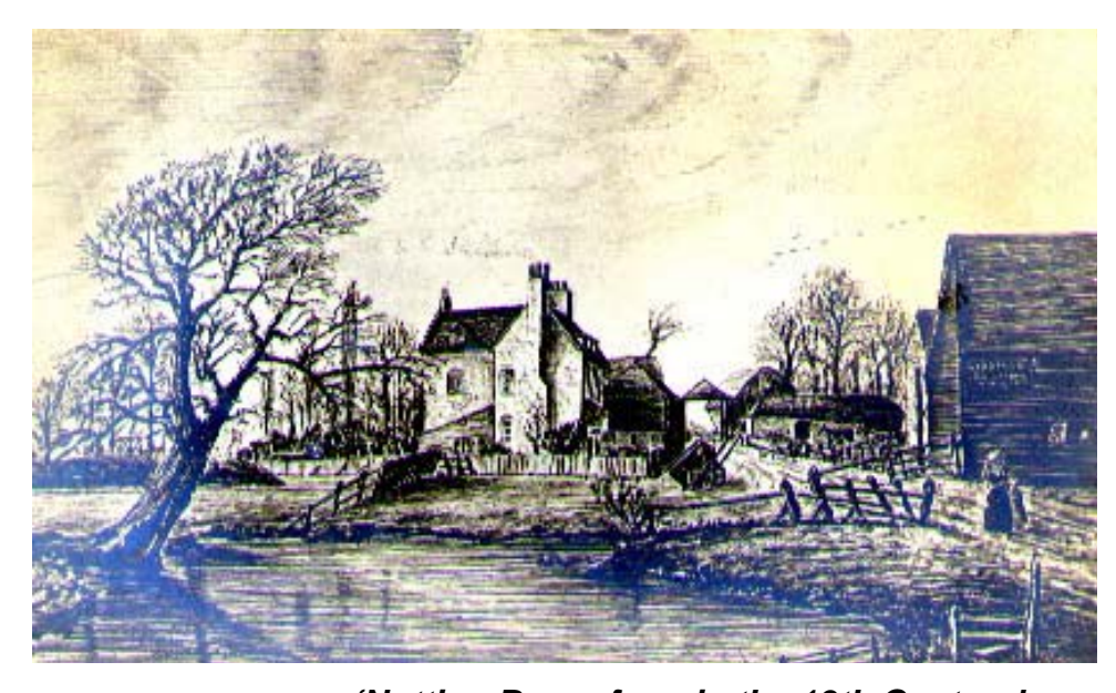
'Notting Barns farm in the 19th Century'

Notting Barns West area included Notting Barns Manor house and grounds. This is regarded as the earliest record of occupation on the land. The manor was surrounded by wooded countryside, which is recorded as "densely wooded thickets, the coverts of game, red and fallow deer, boars and wild bulls" which was once known as Middlesex forest.