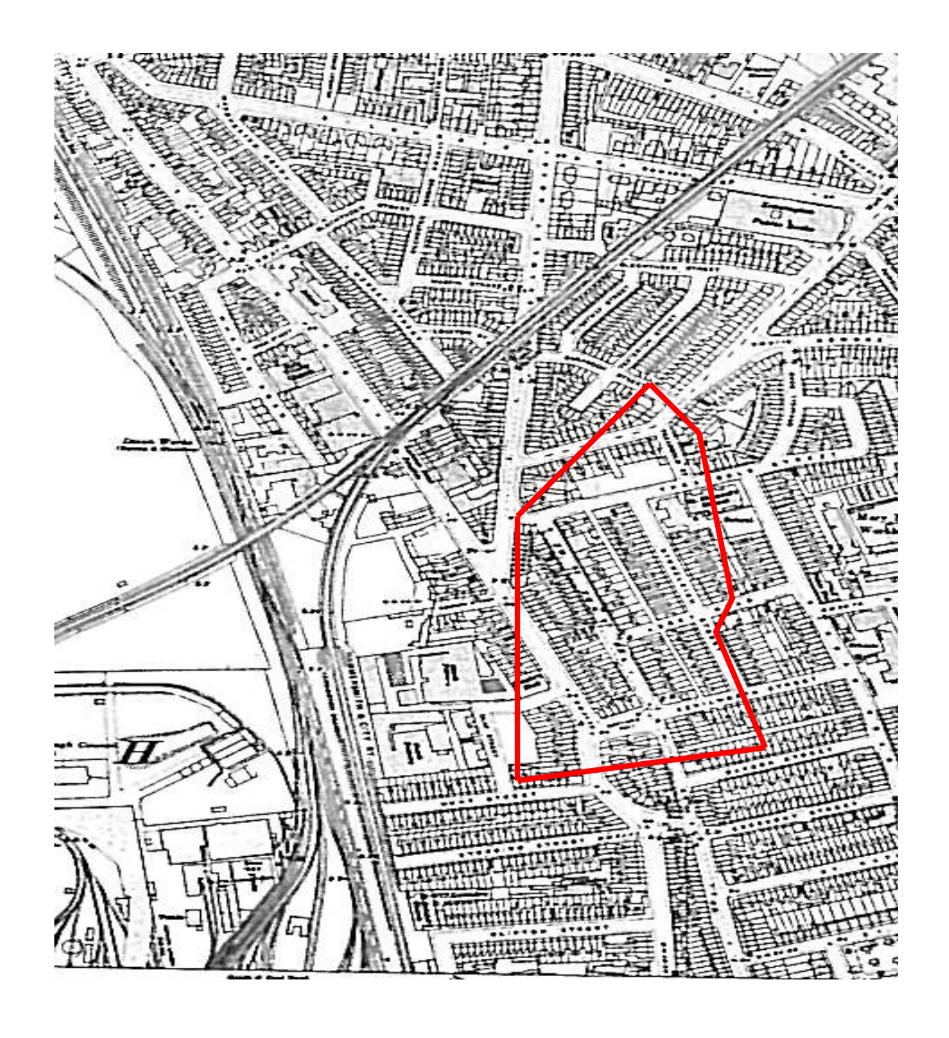
1893- Developments upon Brickfields, such as dense housing. Roads have now been incorporated into the area. The surrounding areas have now been developed into low density housing. And the agriculture and industry has begun to disappear.