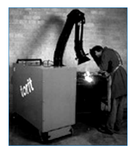
Figure 2.10 Local exhaust ventilation system for welding and soldering purposes