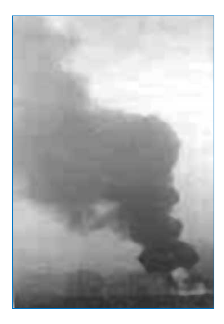
Figure 2.6 Open bonfire