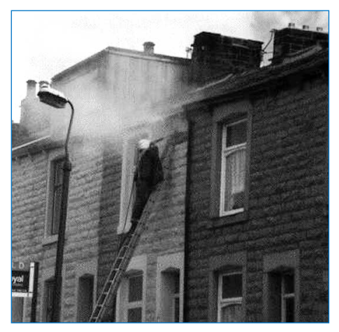
Figure 2.9 Dust generation from sand-blasting