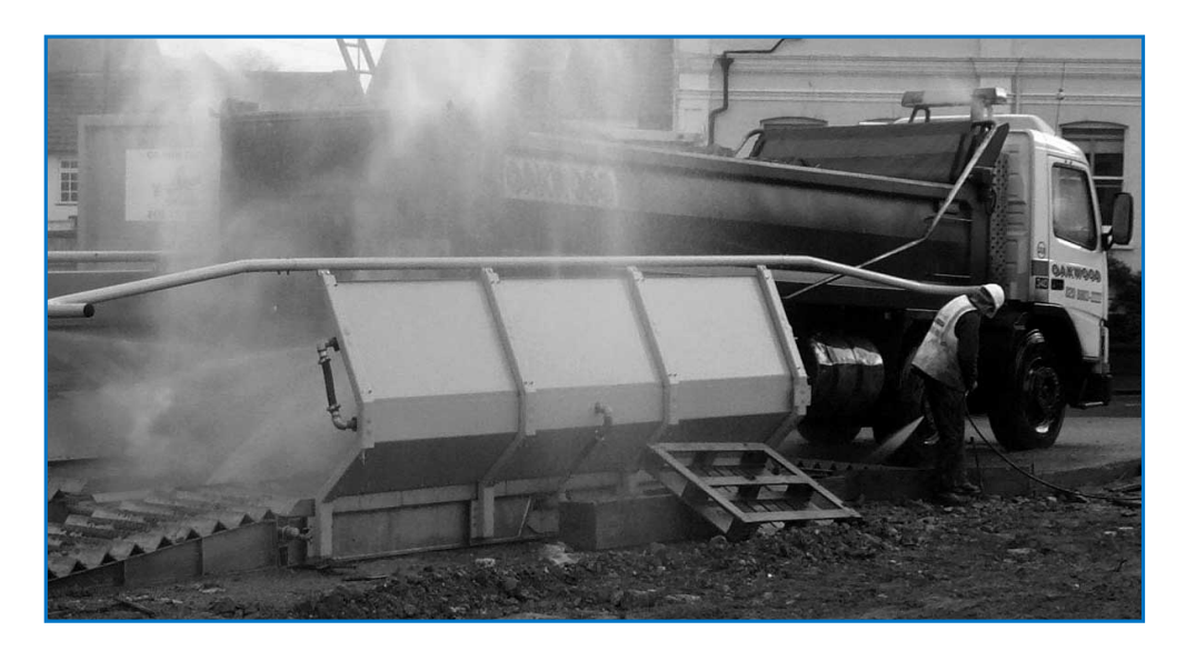
Figure 2.3 Wheel washing of lorry prior to exiting site