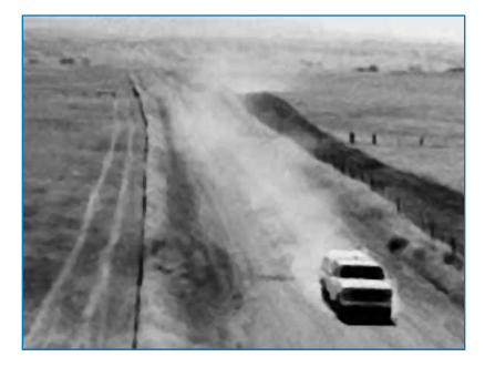
Figure 2.1 Vehicle-raised particles from an unpaved roadway

Since many of the techniques given in Table 2.1 rely on washing and damping down, it is important that the run-off water does not itself become a source of water pollution.