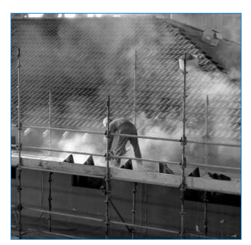
Figure 2.8 Dust generation from disc cutting

Operations such as cutting, grinding and sand-blasting can be major sources of airborne particles (Figures 2.8 and 2.9). If cutting and grinding operations are carried out on site, equipment and techniques incorporating the best available dust suppression measures should be used to keep dust emissions to a minimum. (Guidance is given in Table 2.11, page 23.) Plant hire companies should be consulted for information on the best equipment currently available. Regular improvements in dust control technology often occur and hence new equipment becomes available to the market.