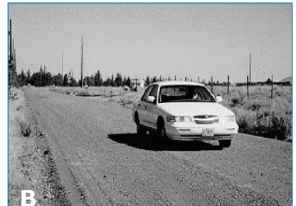
Figure 2.2 Road surface (A) without dust control and (B) with dust control