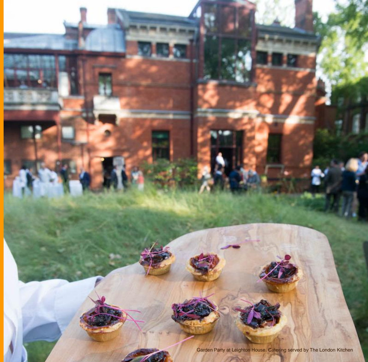
Garden Party at Leighton House. Catering served by The London Kitchen

Packages offer fine dining experiences at Leighton's original dining table, hardly ever used since his death in 1896, which provides an intimate yet spectacular opportunity to entertain your top clients or closest friends; or in Leighton's grand studio, a stunning environment with its high ceilings, large north-facing window and walls lined with Leighton's original artworks. The evening includes additional benefits for your guests as they will have exclusive access to Flaming June: The Making of an Icon through bespoke guided tours and much more.