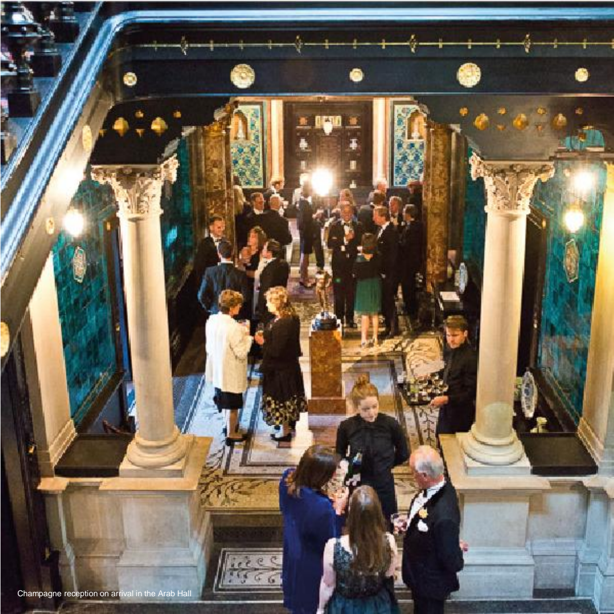
Champagne reception on arrival in the Arab Hall