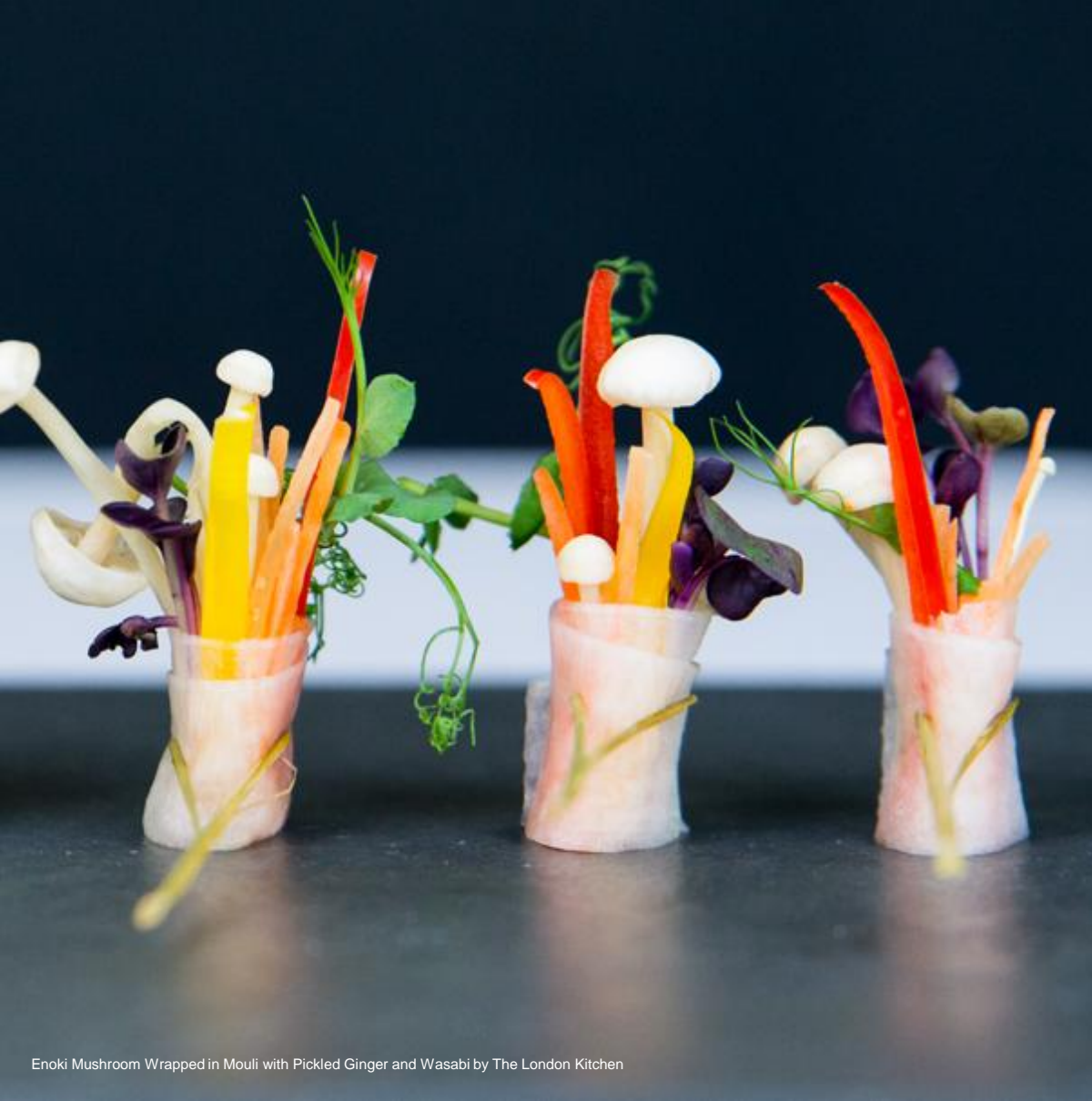
Enoki Mushroom Wrapped in Mouli with Pickled Ginger and Wasabi by The London Kitchen