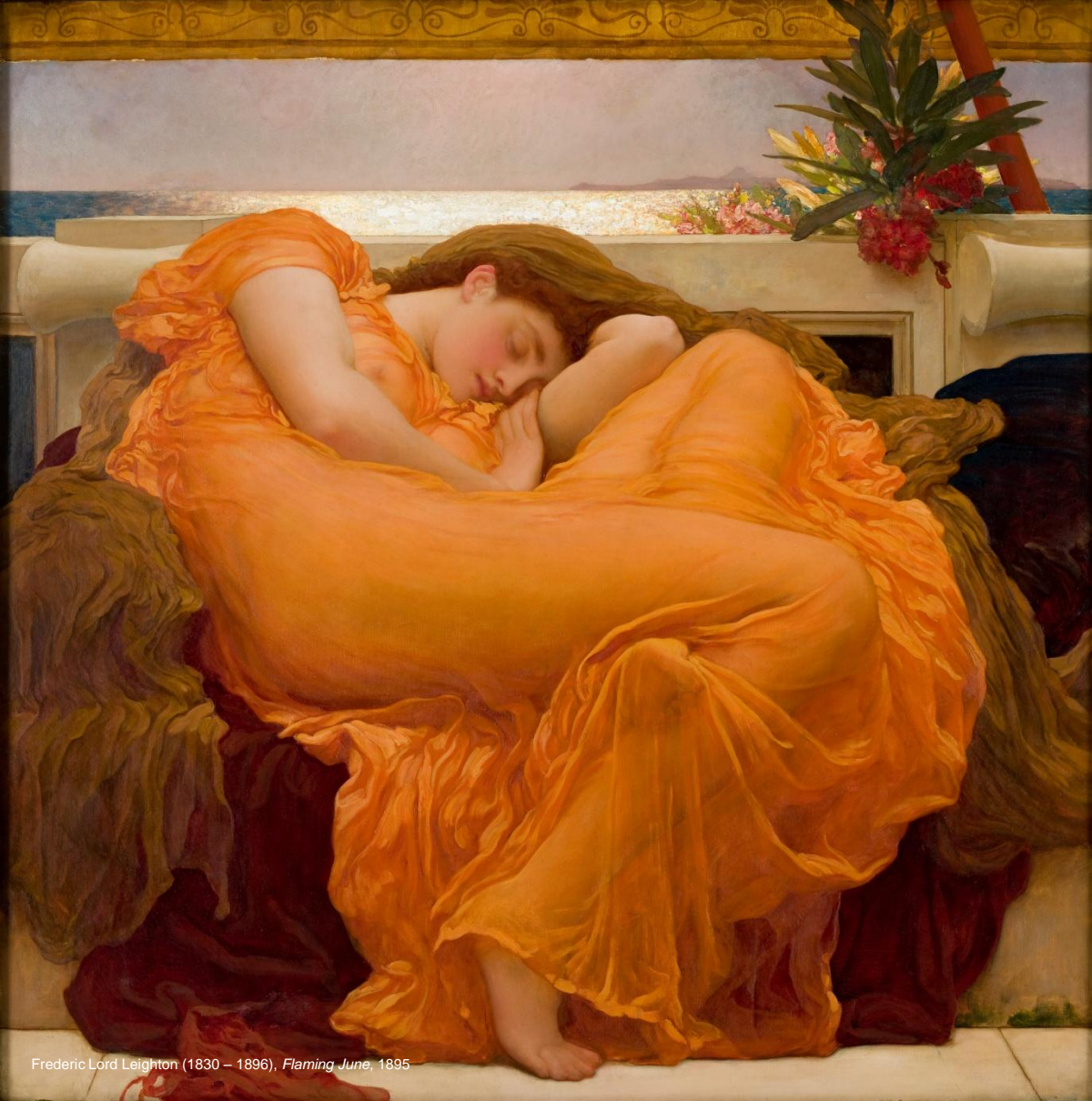
Frederic Lord Leighton (1830 – 1896), Flaming June , 1895