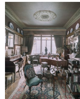
18 STAFFORD TERRACE