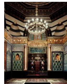
LEIGHTON HOUSE MUSEUM