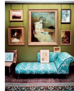
LEIGHTON HOUSE MUSEUM