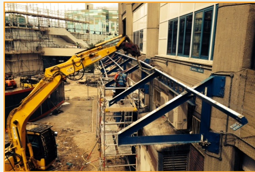
The canopy being removed

From next month the main temporary access to Grenfell will be from the walkway leading from Latimer Road or the stairs from Grenfell Road.