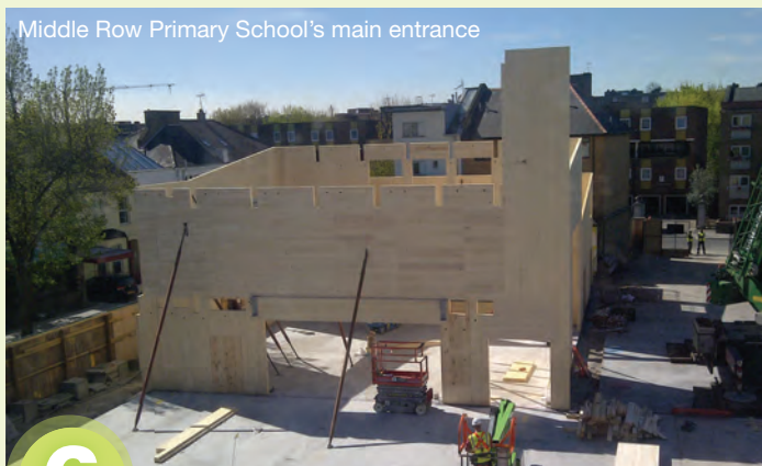
Middle Row Primary School's main entrance

A brand new Middle Row Primary School is rapidly taking shape. The old school was out of date, inflexible and in need of major repair. Not only will the new one be smart and attractive it will offer all the facilities we would want for our children. To help fund the building we are also creating new apartments and commercial space alongside.