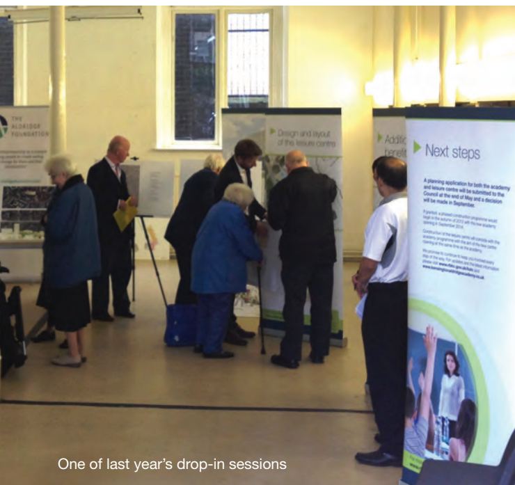
One of last year's drop-in sessions