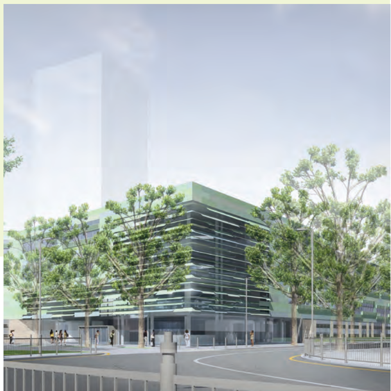
Artist's impression of the north-east view of the academy's main entrance

We will be updating residents on the panel's progress through future editions of this newsletter.