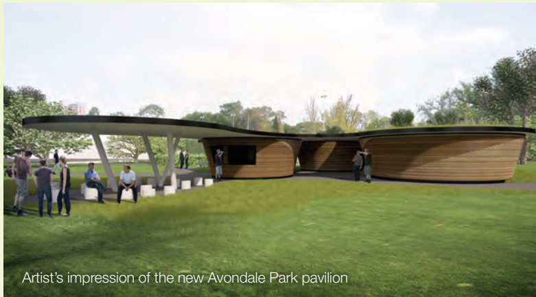
Artist's impression of the new Avondale Park pavilion

Also soon to be completed is a brand new pavilion for Avondale Park. The building will house changing rooms, toilets, a snack kiosk and a sheltered picnic area. Its design is intended to reflect the historic kilns and potteries of Avondale and Notting Hill.