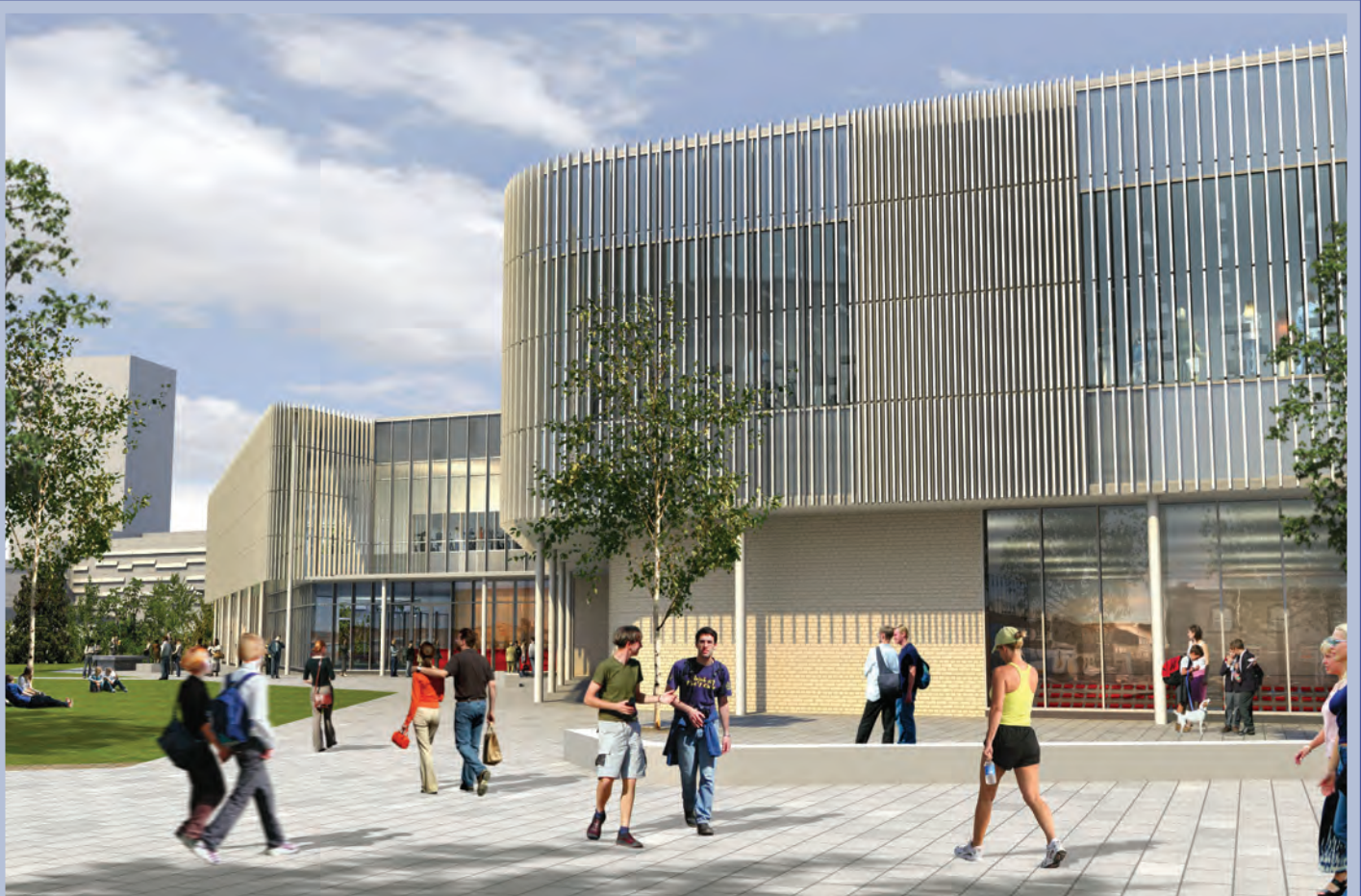
Artist's impression of the southern approach to the leisure centre.

During construction we realise that there has been unavoidable disruption and inconvenience for those living close to the site and we would like to thank you for your continued patience.