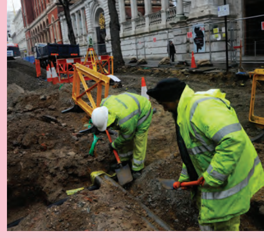
Bad weather doesn't stop our site team - some worked in tents, others just got wet