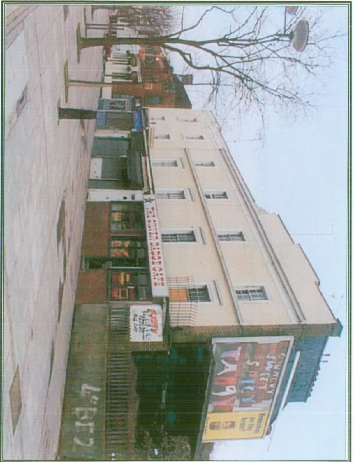
14 - 24 Norland Road, W11