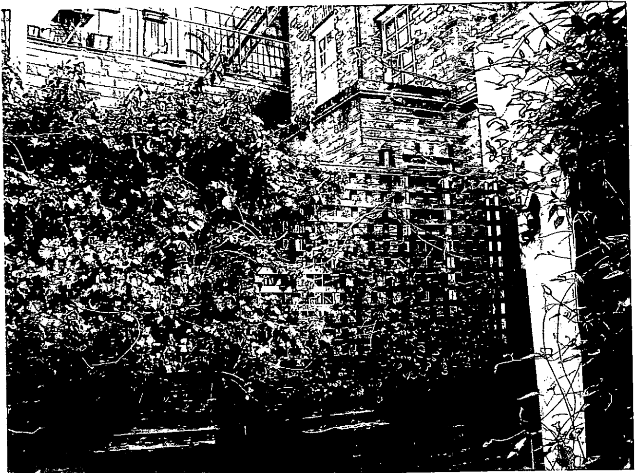
DSCN0279.JPG 2004/04/25 15:19:55