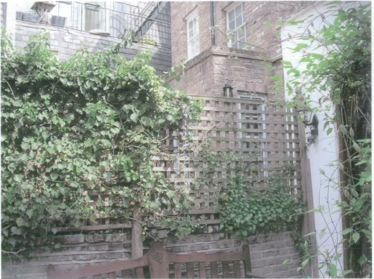
DSCN0279.JPG 2004/04/25 15:19:55