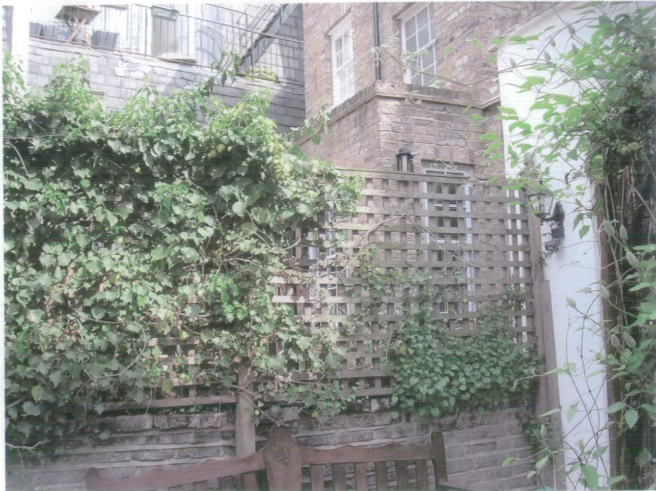
DSCN0279.JPG 2004/04/25 15:19:55