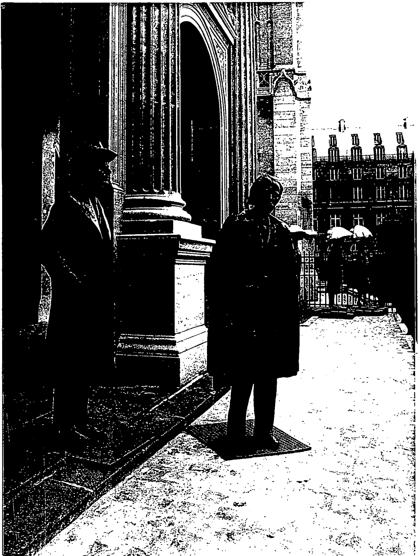
Imre Varga's statues of Bartók and Kodály for Paris