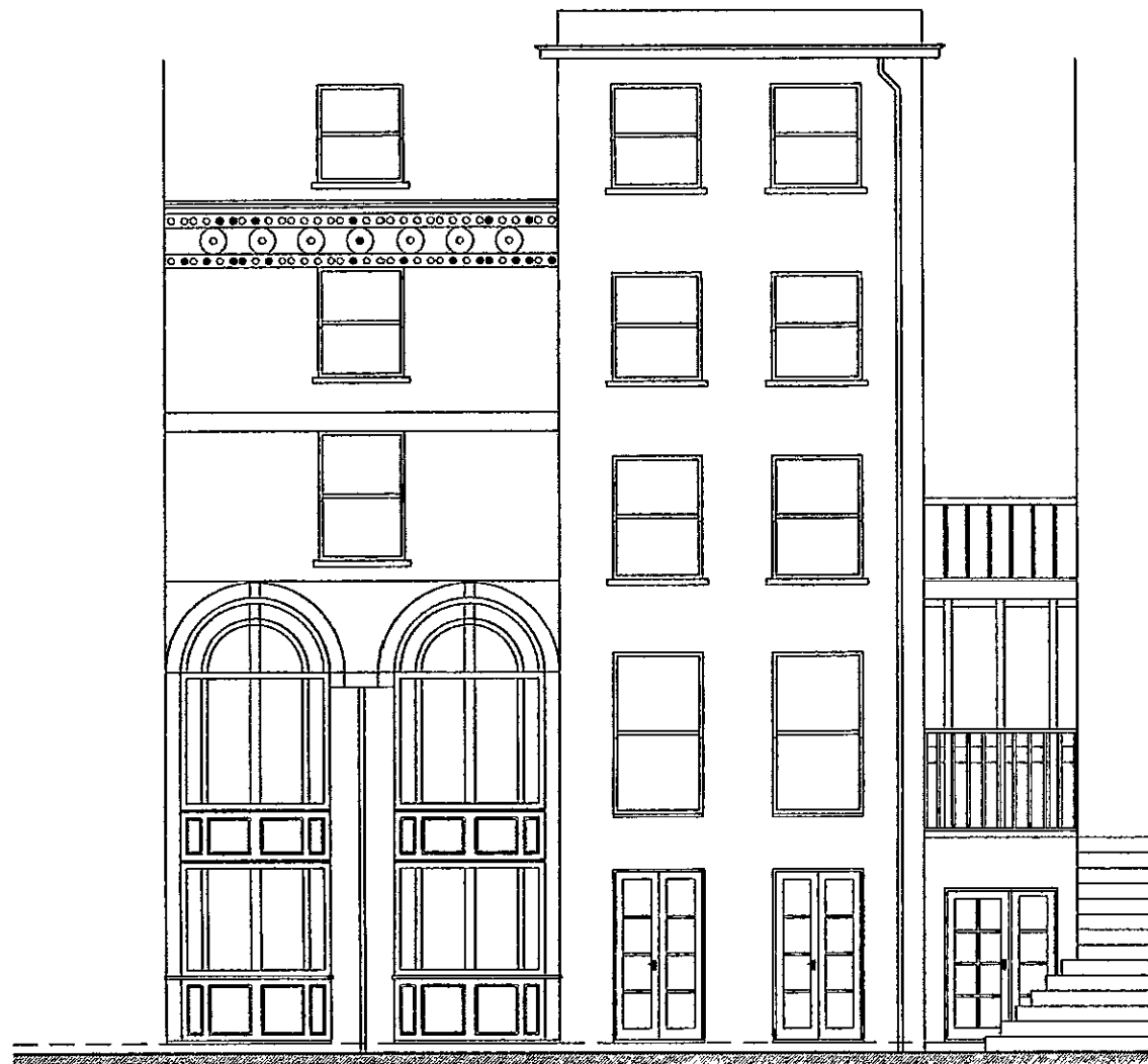
EXISTING SOUTH WEST ELEVATION