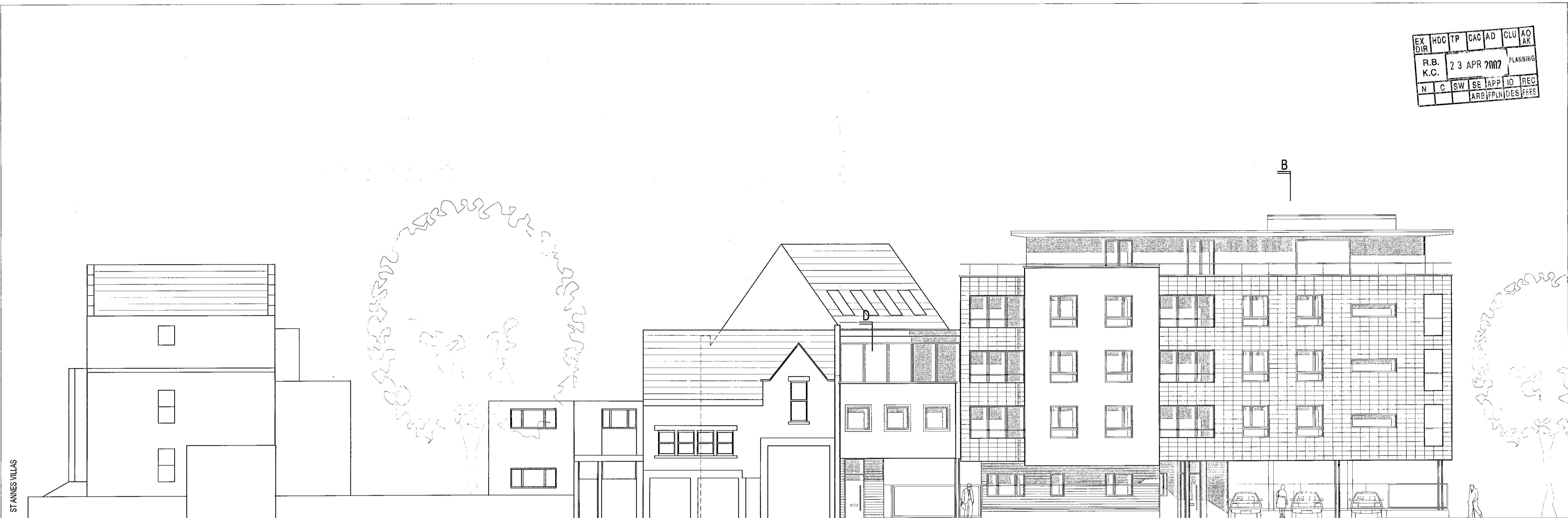
NORTH ELEVATION SWANSCOMBE ROAD