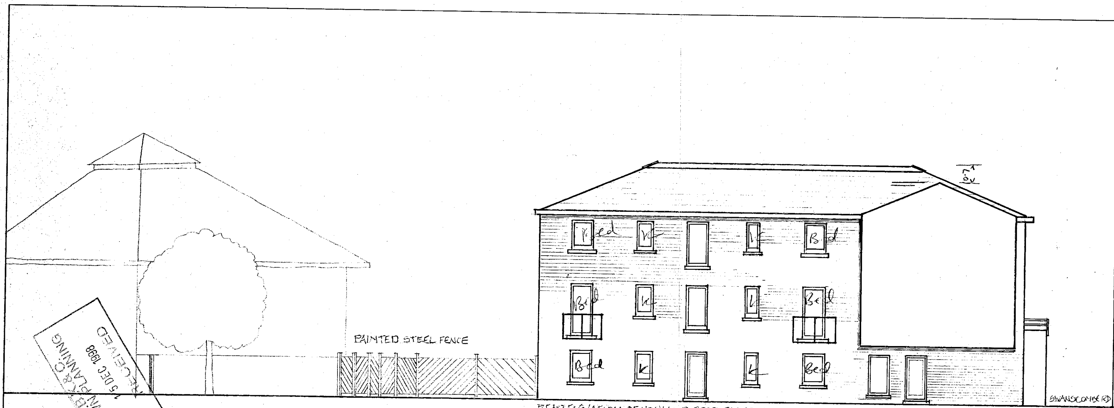
REAR ELEVATION OF NORLAND ROAD FLATS VIEWED FROM EAST