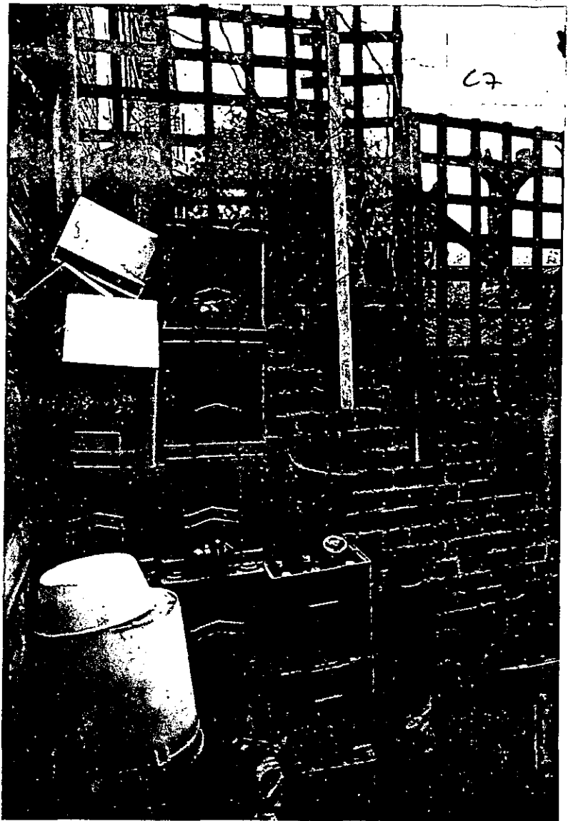
REAR YARD - STORAGE TP981912