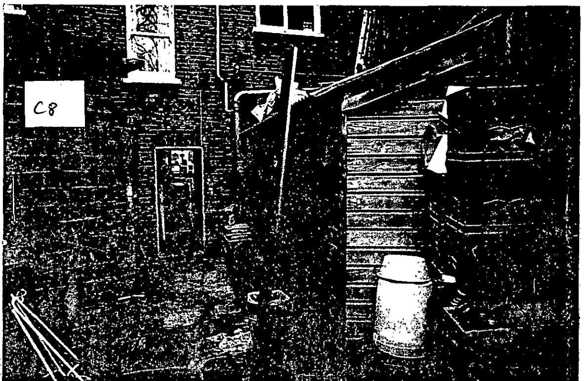
REAR YARD - REAR WALL TO 32 ST LAWRENCE TERRACE